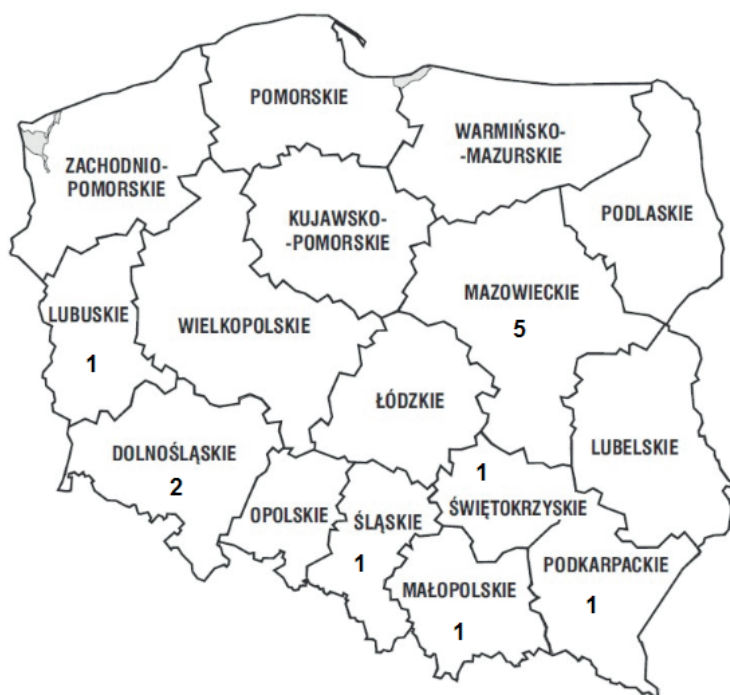
Fig. 2. Distribution and amount of domestic entities having R4 powers with respect to waste batteries and accumulators (excluding lead-acid ones) according to GIOS data (May 2016)

Two plants for processing waste Ni-Cd batteries and accumulators with a capacity of 2,000 t are in Poland [19]. Considering the mass of waste Ni-Cd batteries and accumulators recycled and the mass of batteries placed on the market in 2014, it is estimated that the capacity of the Ni-Cd cells recycling system is sufficient. However, according to the authors of the "National Waste Management Plan" [19], some recycling installations (especially the smaller ones) does not meet BAT requirements.