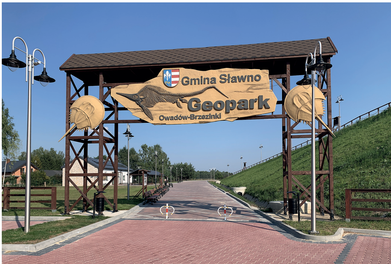
Fig. 2. The entrance gate to the Owadów-Brzezinki Geosite (geopark) in Sławno community.