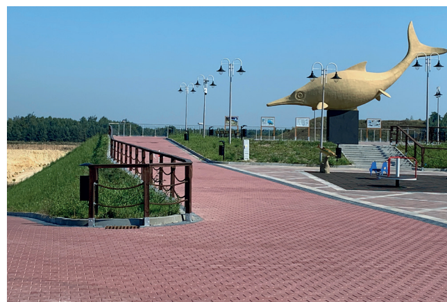
Fig. 8. The 12-meters long monument of the ichthyosaur, as the symbol of the geoeucational area (geopark) is exposed in the central part of the viewing platform.