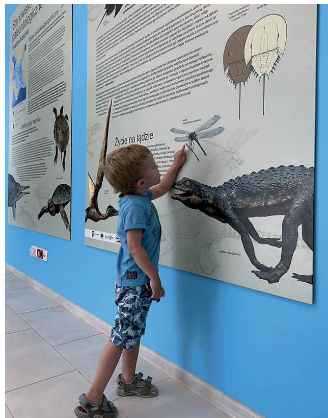
Fig. 7. On the walls, plates are located depicting the palaeogeographical and palaeoenvironmental history of the site.