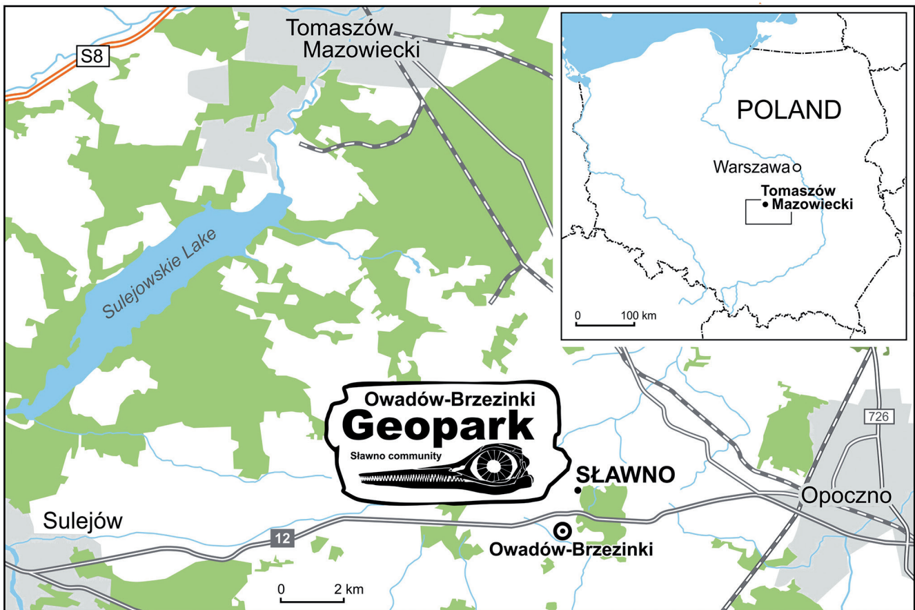
Fig. 1. Location map of the geoeducational area (“Owadów-Brzezinki Geopark”)

Although the name geopark has been introduced here in advance, when one considers all requirements and procedures necessary for the formal recognition of such a status (see e.g., Alexandrowicz, 2006), future activities would be undertaken to include that area into the formal geopark network, due to its educational and scientific significance. However so far, the formal status of the discussed territory from the standpoint of geoconservation is not definitely settled, and the name “Owadów-Brzezinki Geopark” is used in the non-standard meaning of the term “geopark”.