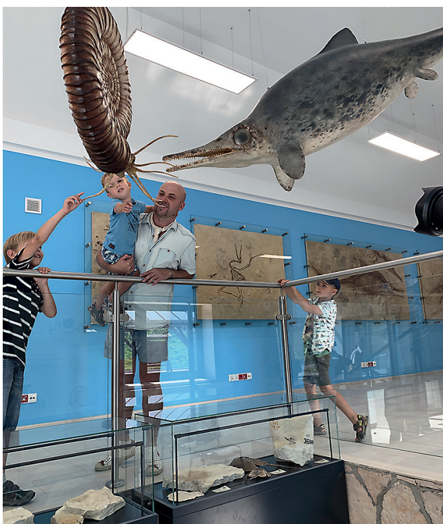
Fig. 6. The palaeontological pavilion presenting life-size reconstructions of animals which inhabited the local seas and islands during the Late Jurassic.