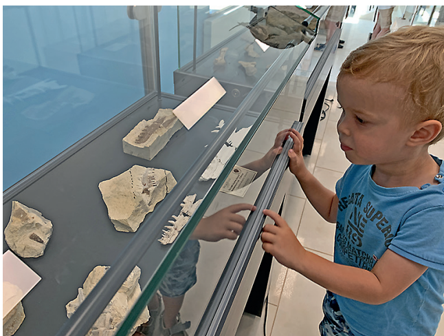
Fig. 5. Exhibition inside the palaeontological pavilion presenting fossils of Late Jurassic marine and terrestrial organisms found in the near quarry.

Gathering, securing and researching this extraordinary collection of fossils is possible thanks to the excellent cooperation between the local government (Sławno Commune Office), Nordkalk Company (owner of the Owadów-Brzezinki Quarry) and the scientific community including various institutions (Institute of Paleobiology and Museum of the Earth, Polish Academy of Sciences; Polish Geological Institute – National Research Institute; Geoscience Friends Association ‘PHACOPS’; and Faculty of Geology, University of Warsaw).