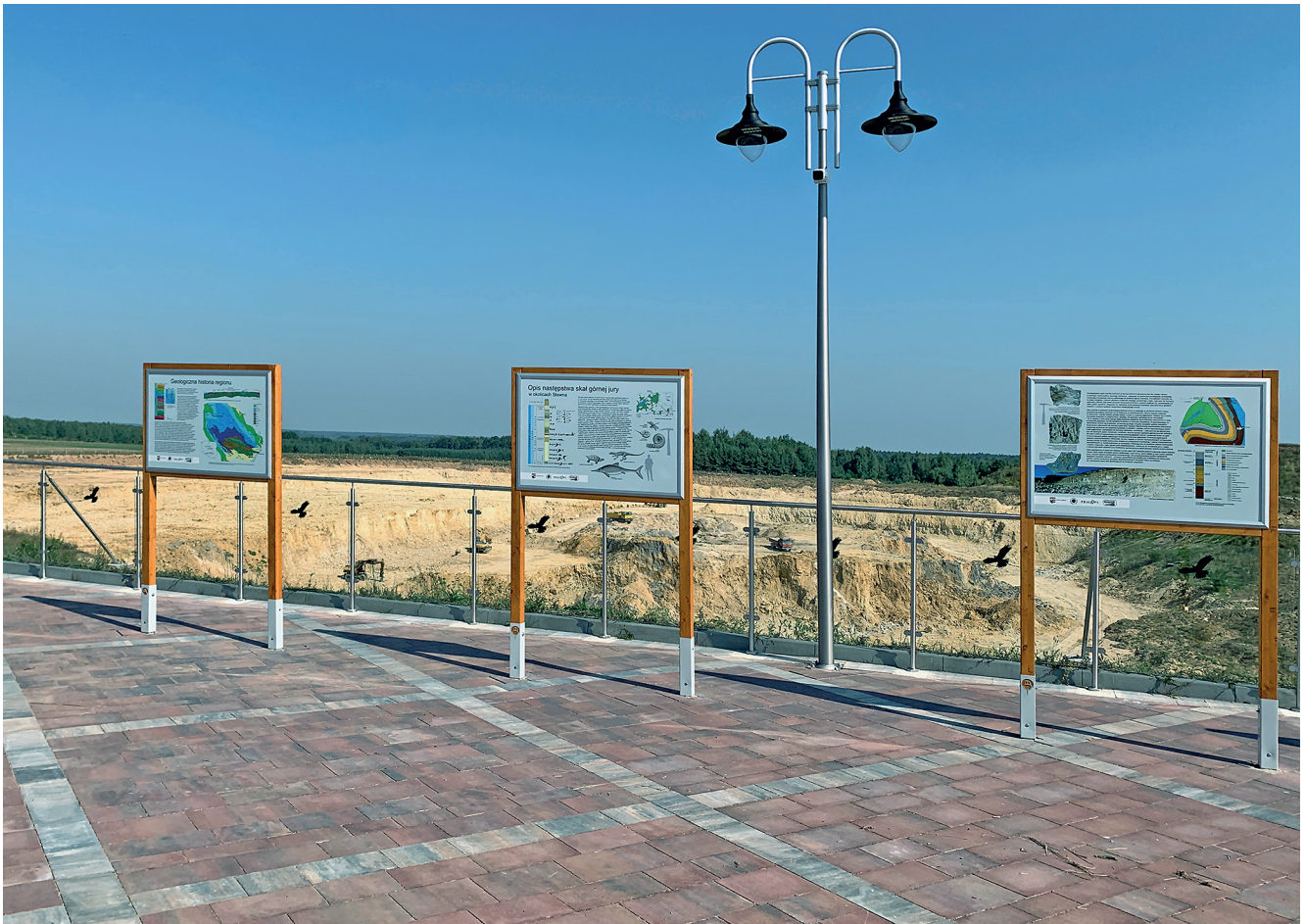
Fig. 4. Geoeducational trail on the panoramic viewing platform, located along the edge of the active quarry.