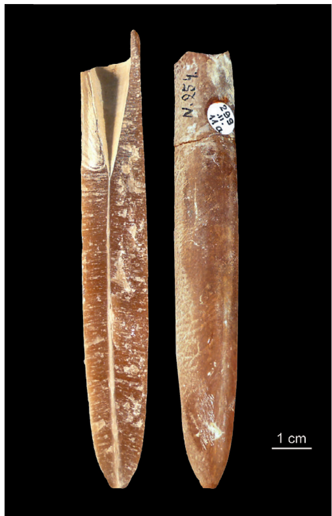
Fig. 4. Belemnite of the genus Belemnella , Upper Cretaceous, Maastrichtian (coll. Geological Muzeum PGI–NRI of Warsaw)

Among interesting places in this region, with Middle Triassic rocks exposed on the surface, is a gorge at Bukowie, south of Kunów (Fig. 1 – point 6). The marls and limestones host a very wide range of fossils. Cephalopods are represented by nautiloids of the genus Germanonautilus , and ammonites of the genus Ceratites (Fig. 5). There are plenty of bivalves, i.a., of the genera Costatoria , Entolium and Lima , Coenothyris brachiopods, and Encrinus crinoids. Sometimes, it is possible to encounter fragments of skeletons of marine reptiles of the genus Nothosaurus .