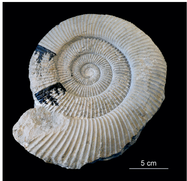
Fig. 9. Ammonite of the genus Perisphinctes , Upper Jurassic, Oxfordian (coll. Geological Museum PGI–NRI of Warsaw)

the section is composed of sandy crinoid limestones rich in fossil crinoids of the genera Balanocrinus and Cyclocrinus (Salamon & Zatoń, 2006), bivalves, e.g. of the genus Ctenostreon , brachiopods of the genera Rhynchonella and Terebratula , and less frequent ammonites, belemnites and nautiloids (Giżejewska & Wieczorek, 1976). In the Zalas quarry, there are also Upper Jurassic limestones that provide many other fossils. These are mostly ammonites, among others, of the genera Holcophylloceras , Sowerbyceras , Peltoceratoides , Perisphinctes (Fig. 9) and Cardioceras (Matyja & Tarkowski, 1981).