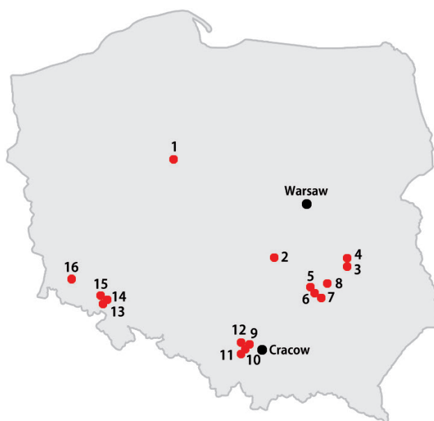
Fig. 1. Location in Poland of the discussed point in the text: 1 – Wapienno/Bielawa; 2 – Owadów Brzezinki; 3 – Kazimierz Dolny; 3 – Nasilów; 5 – Doły Opacie; 6 – Bukowie; 7 – Gromadzice; 8 – Bałtów; 9 – Krzeszowice; 10 – Zalas; 11 – Kwaczała; 12 – Karniowice; 13 – Pogorzały; 14 – Lake Daisy; 15 – Lubiechów; 16 – Radłówka

To illustrate the possibilities of fossil gathering in several regions of Poland, let us look at some suggestions for one-day palaeontological tours. In the following article, selected palaeontological sites from the north of Poland, through Central Poland, to the south are described. Discussed points in this article are located on the schematic map of Poland (Fig. 1).