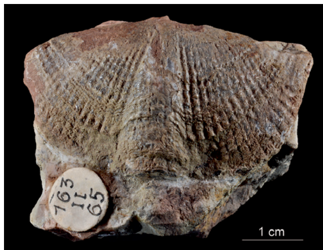
Fig. 11. Brachiopod of the genus Cyrtospirifer , Upper Devonian, Famennian (coll. Geological Museum PGI–NRI of Warsaw)