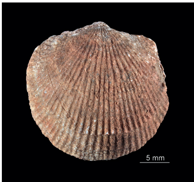
Fig. 10. Brachiopod of the genus Atrypa , Middle Devonian, Givetian (coll. Geological Museum PGI–NRI of Warsaw)

If we go about 3.5 km further northwest from Lake Daisy to the village of Lubiechów (Fig. 1 – point 15), we find thick-bedded conglomerates exposed, including pebbles of Upper Devonian limestones that yield fossils, among others, of Alveolites tabulate corals and Amphipora stromatoporoids, as well as brachiopods (Fig. 12) of the genus Gypidula (Gunia, 1962b).