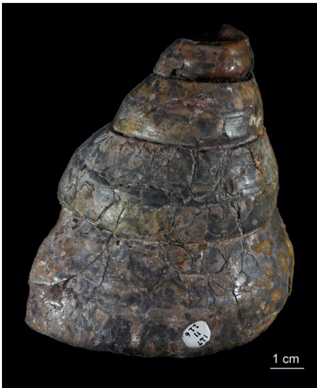
Fig. 8. Gastropod of the genus Pleurotomaria , Middle Jurassic, Bathonian (coll. Geological Museum PGI–NRI of Warsaw)

In the nearby village of Zalas (Fig. 1 – point 10), there is also a quarry exposing Middle Jurassic rocks. In the lower part, these are marine sands and less common quartz sandstones and conglomerates, containing well-preserved fossils of ammonites, including those of the genus Macrocephalites , and fragments of belemnites, bivalves, gastropods, echinoderms and corals of the genus Isastrea . The upper part of