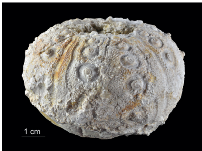
Fig. 2. Echinoid of the genus Rhabdocidaris , Upper Jurassic, Oxfordian (coll. Geological Museum PGI-NRI of Warsaw), photo K. Skurczyńska-Garwolińska

et al. , 1985). Exploitation of rocks is carried out in the Upper Jurassic (Oxfordian) limestones, offering numerous fossils, among others, starfish ( Sphaeraster ), stalked ( Cyclocrinus ) and free-living ( Semiometra ) crinoids, echinoderms ( Rhabdocidaris (Fig. 2) and Plegiocidaris ), polychaetes ( Pannoserpula ) and numerous ammonites, brachiopods and sponges (Radwańska, 2007). Because it is an active quarry, we must get permission if we want to enter its area and look for fossils.