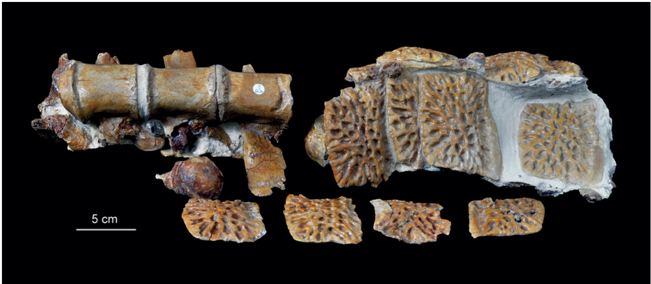
Fig. 3. Skeletons elements of Thoracosaurus , Paleocene (coll. Geological Muzeum PGI–NRI of Warsaw)

Southwest of Nasilów, we encounter a real “fossil basin” which is the Holy Cross region. Among the many areas abounding in fossils, we are going to be acquainted with only one – the environs of Ostrowiec Świętokrzyski. In the Nietulisko area, northwest of Ostrowiec, there are numerous borrow pits, where Lower Triassic sandstones have been mined for a long time. In the Doły Opacie quarry (Fig. 1 – point 5), we can even notice that these rocks overlie Devonian dolomites exhibiting a disconformity. Lower Triassic sandstones of this area are represented by several rock complexes, including the Labyrinthodont Beds that contain bones of amphibians – labyrinthodontes, as well as footprints of reptiles called Isochirotherium and Chirotherium (Ptaszyński, 1996, 2000). We can imagine that lots of animals lived around an inland water body in this area, and its soft, muddy and flat shores favoured the preservation of footprints of these animals. It is worth mentioning, that the fossil tracks of Mesozoic reptiles were the main reasons for the creation of legends of evil paws and diabolical stones. In the cherry-coloured calcareous sandstones, which occur as interbeds, you can also find Gervillia mollusc fossils and, sometimes, fossil fish scales and bones.