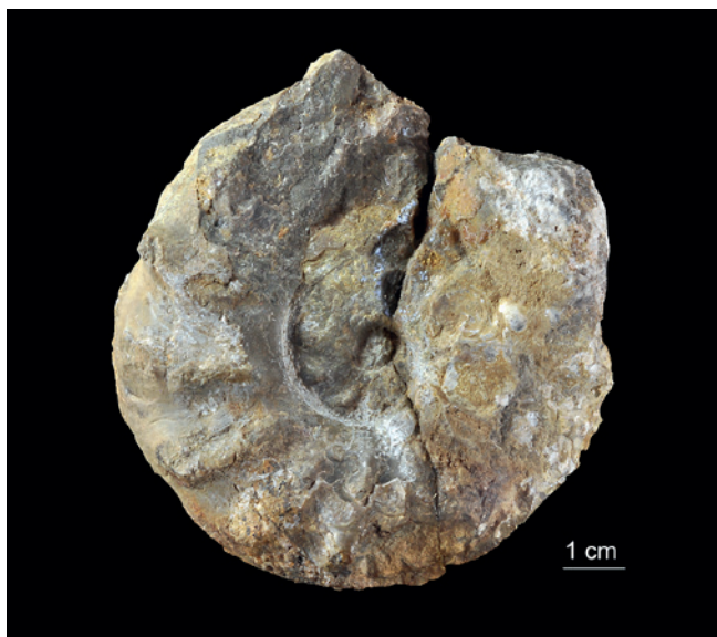
Fig. 5. Ammonite of the genus Ceratites , Middle Triassic, Muschelkalk (coll. Geological Muzeum PGI–NRI of Warsaw)

It is also worth visiting the valley of the Kamionka River, near the village of Gromadzice to the south of Ostrowiec Świętokrzyski (Fig. 1 – point 7), where Lower Jurassic rocks outcrop. The best exposures are situated on the eastern slope of the valley, north of the village. This site is called Las Godziny by the locals. The valley scarp and numerous pits expose sandstones and siltstones that accumulated initially in fluvial and lacustrine environments and later in deltaic and nearshore settings. The rocks contain en masse occurrences of flora remains. About 50 plant species were described from them already almost 100 years ago. These are the Ginkgoaceae of the genera Ginkgo , Czekanowskia and Baiera , cycads of the genera Pterophyllum and Nilssonia , and pteridosperms of the genera Cladophlebis and Dictyophyllum (Makarewiczówna, 1928). Moreover, with good fortune, you can find footprints of several species of both predatory and herbivorous dinosaurs (Gierliński & Pieńkowski, 1997) and, in the upper part of the section, marine bivalves of the genus Cardinia .