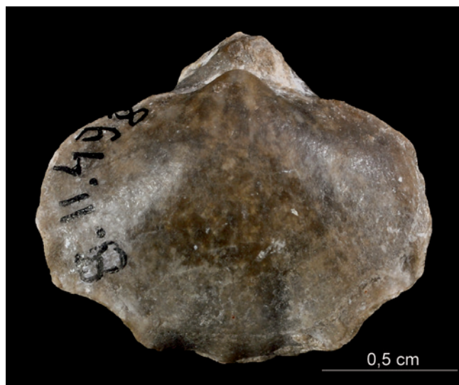
Fig. 12. Brachiopod of the genus Gypidula , Middle Devonian, Givetian (coll. Geological Museum PGI–NRI of Warsaw)

From the Świebodzice environs, we can move to the last region – in the vicinity of Lwówek Śląski (Fig. 1 – point 16). Several kilometres west of this town, near the village of Radłówka, there is a bushed quarry whose north-western edge approaches the road. The quarry exposes Upper Permian light grey thick-bedded limestones overlain by brownish sandy clay shales. In these rocks, it is possible to encounter fossil brachiopods of Productus , and bivalves, including the genera Schizodus and Pseudomonotis . If we are lucky, we can meet better- or worse-preserved imprints of fish representing the genus Palaeoniscus . In the village of Mojesz, located a few kilometres south of Lwówek Śląski, between