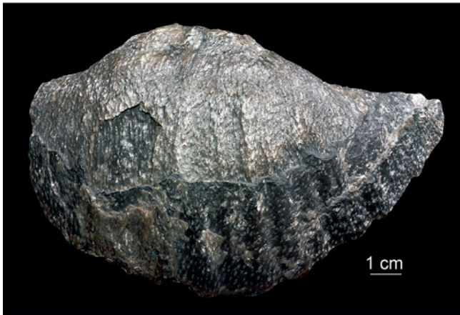
Fig. 7. Brachiopod of the genus Gigantoproductus , Carboniferous, Visean (coll. Geological Museum PGI–NRI of Warsaw), photo K. Skurczyńska-Garwolińska