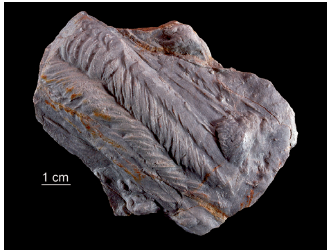
Fig. 13. Trackway of the Cambrian Trilobite (coll. Geological Museum PGI–NRI of Warsaw), photo K. Skurczyńska-Garwolińska

ichnofossils. Trace fossils, which tell us many things about the sedimentary environment, can be preserved on the surface of sediment layers or inside them. The sediment surface can reveal traces of creeping and crawling of organisms, known as organic hieroglyphs. Examples of such hieroglyphs are traces of trilobites – Palaeozoic marine arthropods. The most beautiful ones can be found in Poland in the active quarry of Wiśniówka Wielka near Kielce, where Cambrian sandstones are exploited. Trilobites (Fig. 13), crawling on the sea floor, lived in shelf (and thus shallow-water) seas. As such the conclusion that the rocks mined in the quarry, which are about 500 million years old, were deposited in a relatively shallow shelf sea, seems to be justified (Bottjer, 2016).