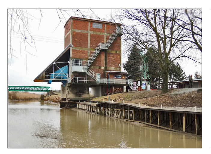
Fig. 8. Technical monuments - tilted lignite dispenser on Bat'a Canal • Zabytek techniki – podnoszony dozownik węgla brunatnego na Kanale Bat'a

The tourists interested in oil production history can visit the monument at the oldest Nesyt oil field or the Museum of Oil Production and Geology in Hodonín, established in the historical building of the former Austro-Hungarian military barracks (Fig. 9). A very interesting exhibition captures the tradition of oil production in Czechoslovakia, the geology of Moravia and the history of petroleum exploration.