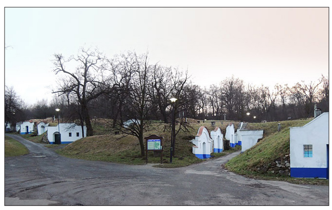
Fig. 5. Unique historical wine cellars Petrov–Plže, • Unikalne, historyczne piwnice winne Petrov–Plže