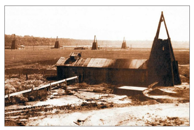
Fig. 2. The Nesyt oil field in 1938 (authors' collection, 2004) • Pole naftowe Nesyt, rok 1938 (ze zbiorów autora, 2004)