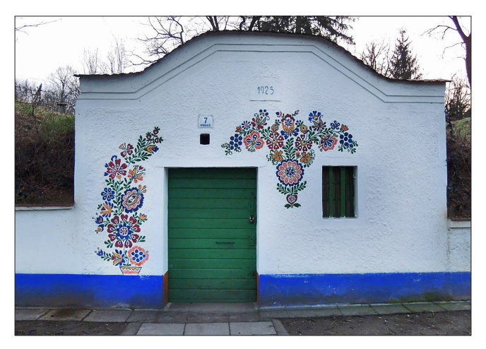
Fig. 6. Entrance to a wine cellar, photo M. Klempa • Wejście do piwnicy winnej, fot. M. Klempa

Archeo-tourism in the region deserves attention, as well. Not far, south-westwards of Hodonín, near the Kyjovka stream is the village Mikulčice, famous for its archaeological excavations in the Slavic hillfort. This early medieval hillfort was one of the most important strongholds in the whole Great Moravia State, in the 9th century. Visitors can experience two exhibitions: The Great Moravian Mikulčice – "Castle in the Morava river meadow" and "Second church – the sacral architecture of the castle" (www.promoravia.blog.cz). Openair walking paths present to the visitors the foundations of several discovered churches and the castle (Fig. 7).