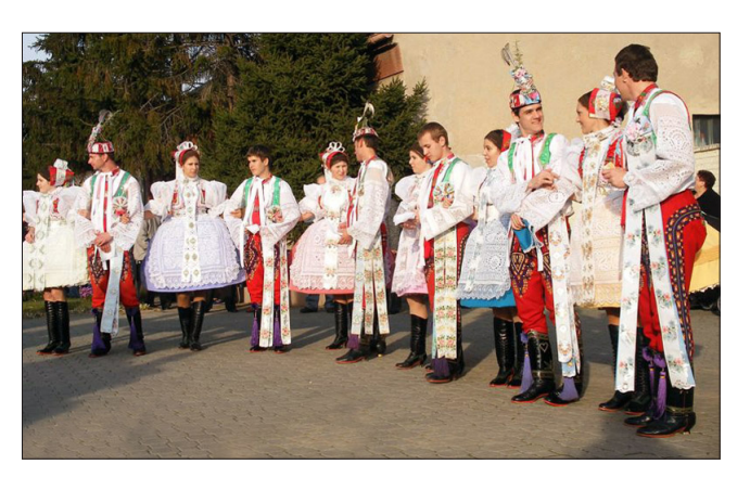
Fig. 4. Typical folk costumes of the region • Typowe stroje ludowe regionu