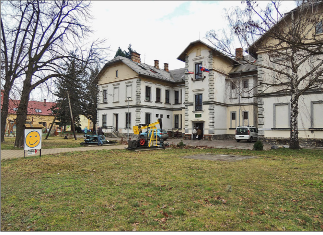
Fig. 9. Historical building of military barracks – today's Museum of Oil Production and Geology in Hodonin • Historyczny budynek koszar – obecnie siedziba Muzeum Eksploatacji Ropy Naftowej i Geologii w Hodonínie