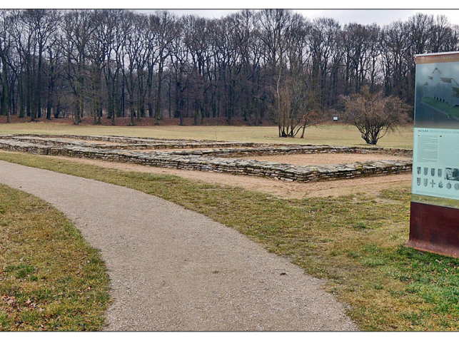
Fig. 7. Remains of early medieval settlements • Pozostałości wczesnośredniowiecznego osiedla