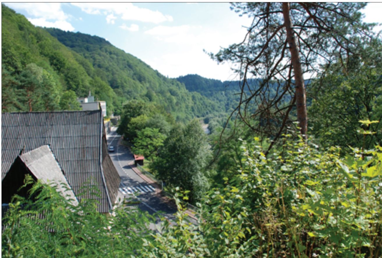
Fig. 1. The Poprad Gorge in Żegiestów-Zdrój • Przełom Popradu w Żegiestowie-Zdroju