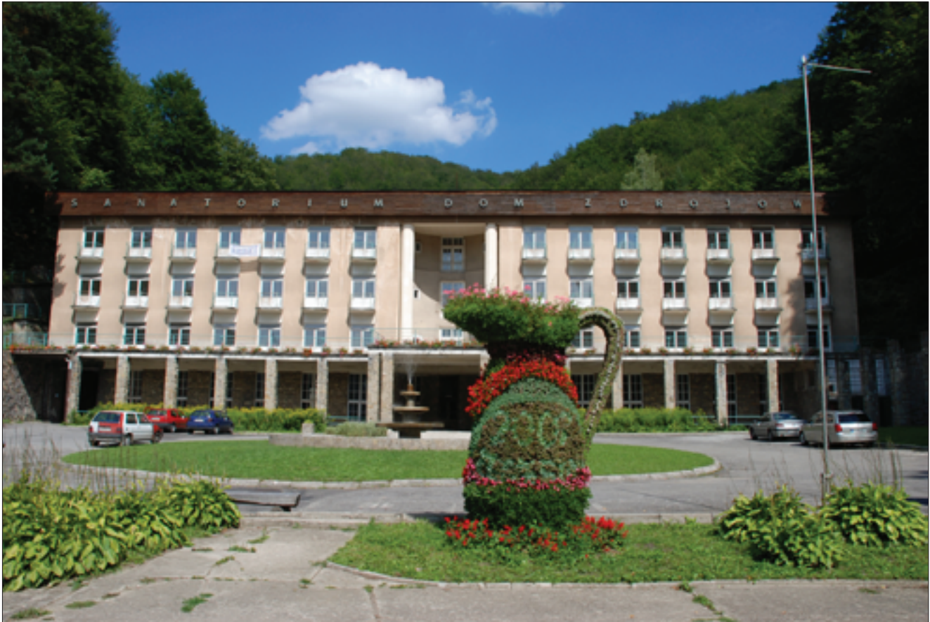
Fig. 3. Spa-House in Żegiestów Zdrój, design project: A. Szyszko-Bohusz, state as of 2010 • Dom Zdrojowy w Żegiestowie-Zdroju, zaprojektowany przez A. Szyszko-Bohusza, stan na rok 2010