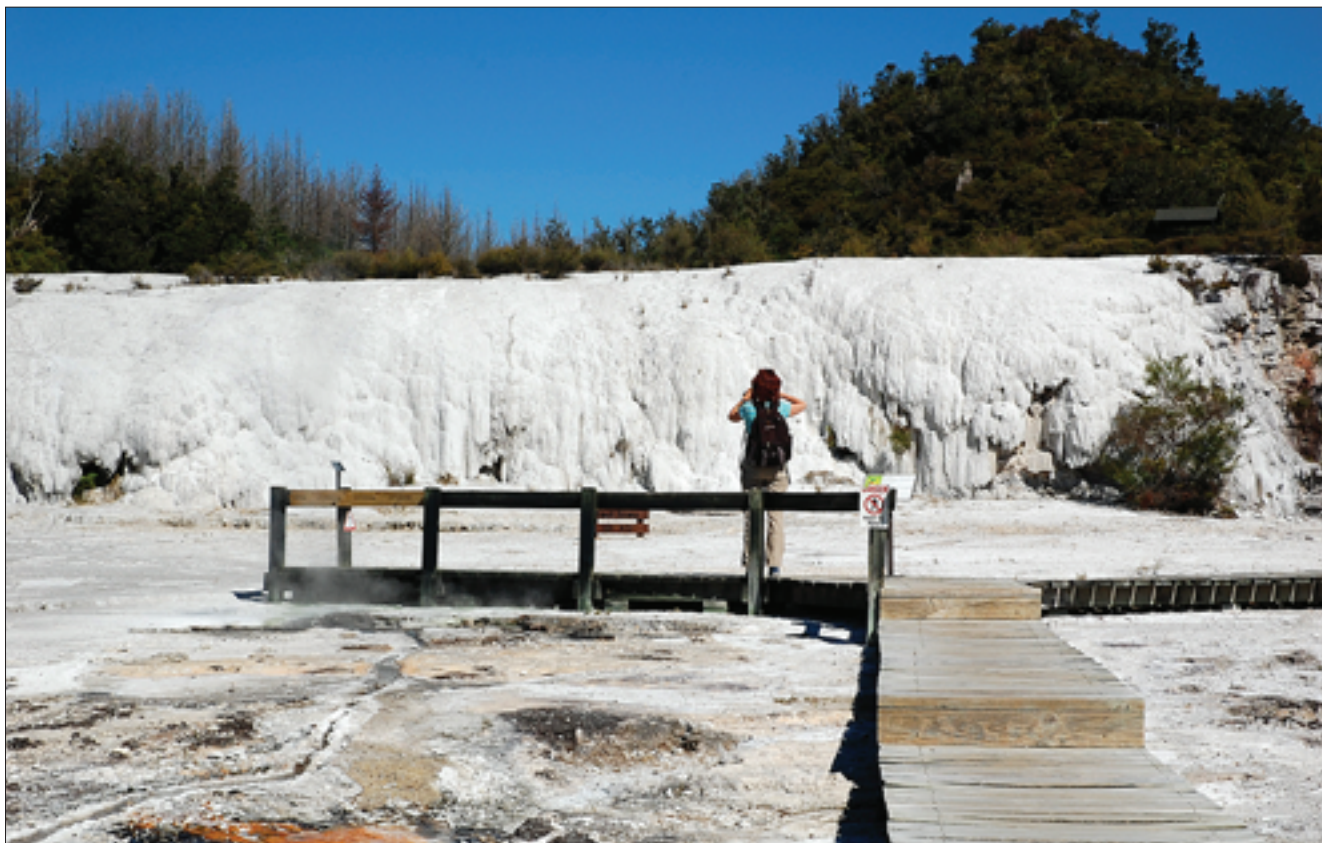
Fig. 15. Silica-covered fault scarp, Orakei Korako Geothermal Park, photo P. Migoń • Skarpa uskokowa pokryta krzemionką wytrąconą z wód hydrotermalnych Orakei Korako Geothermal Park, fot. P. Migoń