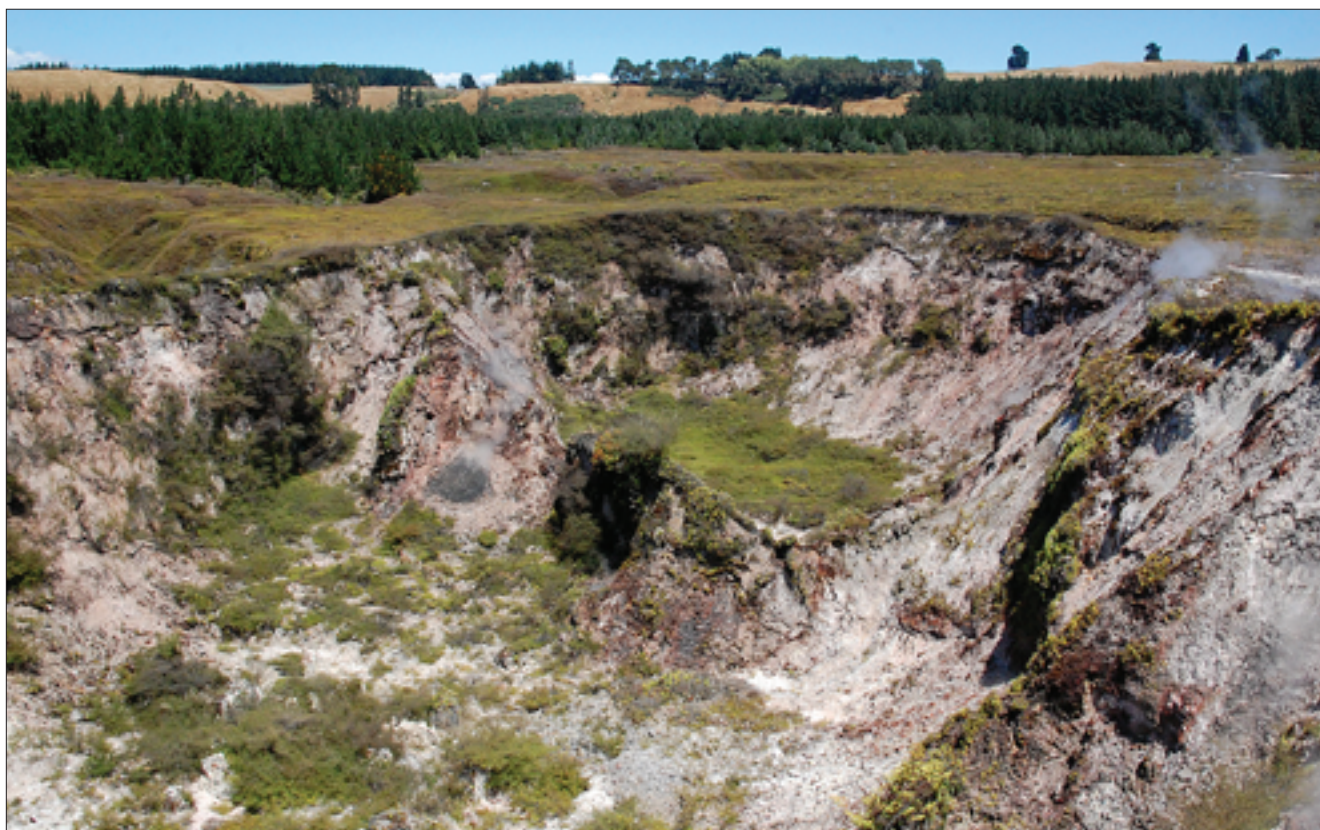
Fig. 18. One of collapse craters in the Craters of the Moon property • Jeden z kraterów zapadliskowych w obszarze Craters of the Moon