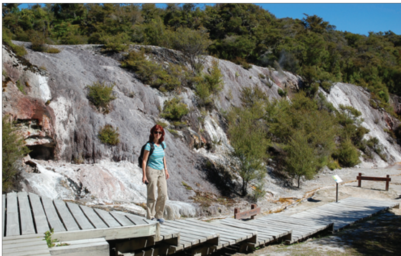
Fig. 20. Wooden boardwalks at Orakei Korako, photo P. Migoń • Drewniane pomosty dla odwiedzających w Orakei Korako, fot. P. Migoń