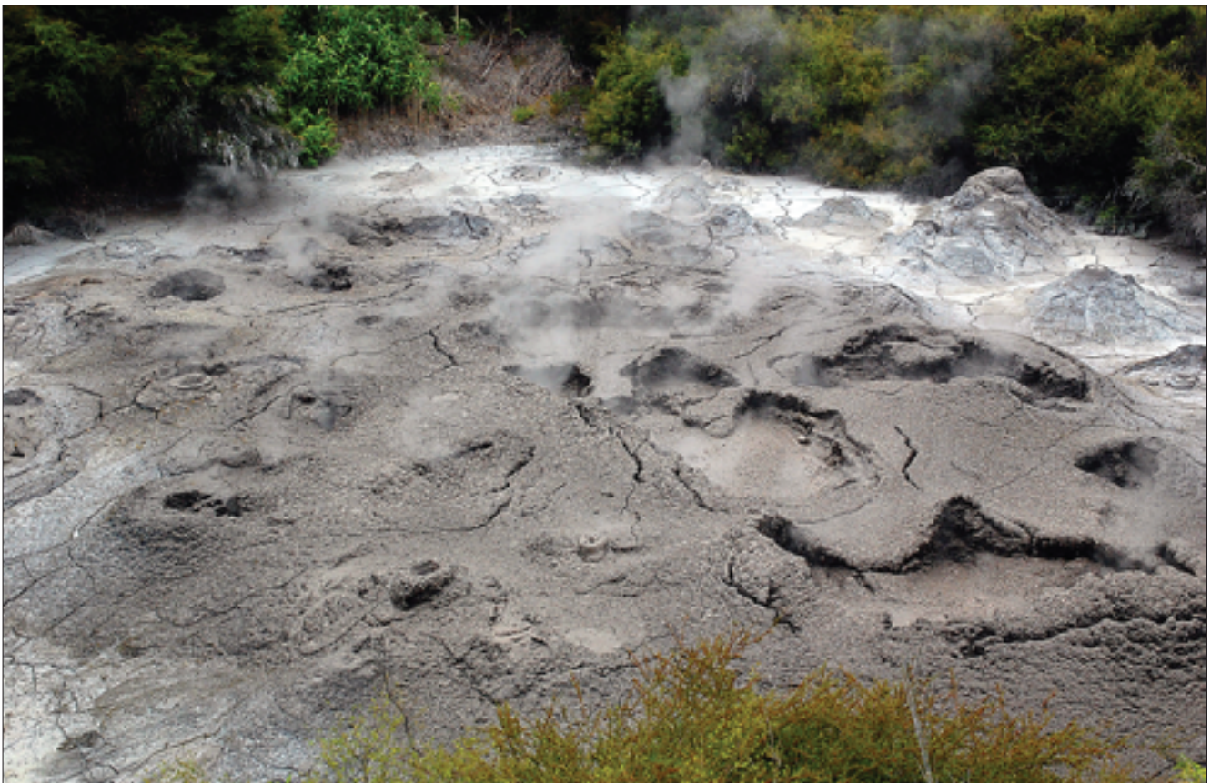
Fig. 3. Extremely active mud pool at Te Puia, Rotorua, photo P. Migoń • Wyjątkowo aktywna sadzawka błotna w Te Puia, Rotorua, fot. P. Migoń

The post-1886 eruption recovery of vegetation provides an opportunity to see many species of native flora, including ferns, kanuka, thermophilous mosses and algae. The site is also connected with Maori history and the history of tourism. Its heydays prior to 1886, to see the Pink and White Terraces, and then in 1900–1904 to witness explosions of the Waimangu Geyser, are recalled on boards throughout the site.