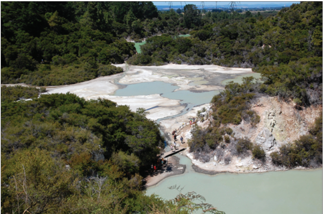
Fig. 11. General view of the lower part of Wai-O-Tapu property, with craters left by prehistoric hydrothermal explosions, photo P. Migoń • Widok ogólny dolnej części obszaru geotermalnego Wai-O-Tapu z kraterami będącymi pozostałością po prehistorycznych erupcjach hydrotermalnych, fot. P. Migoń