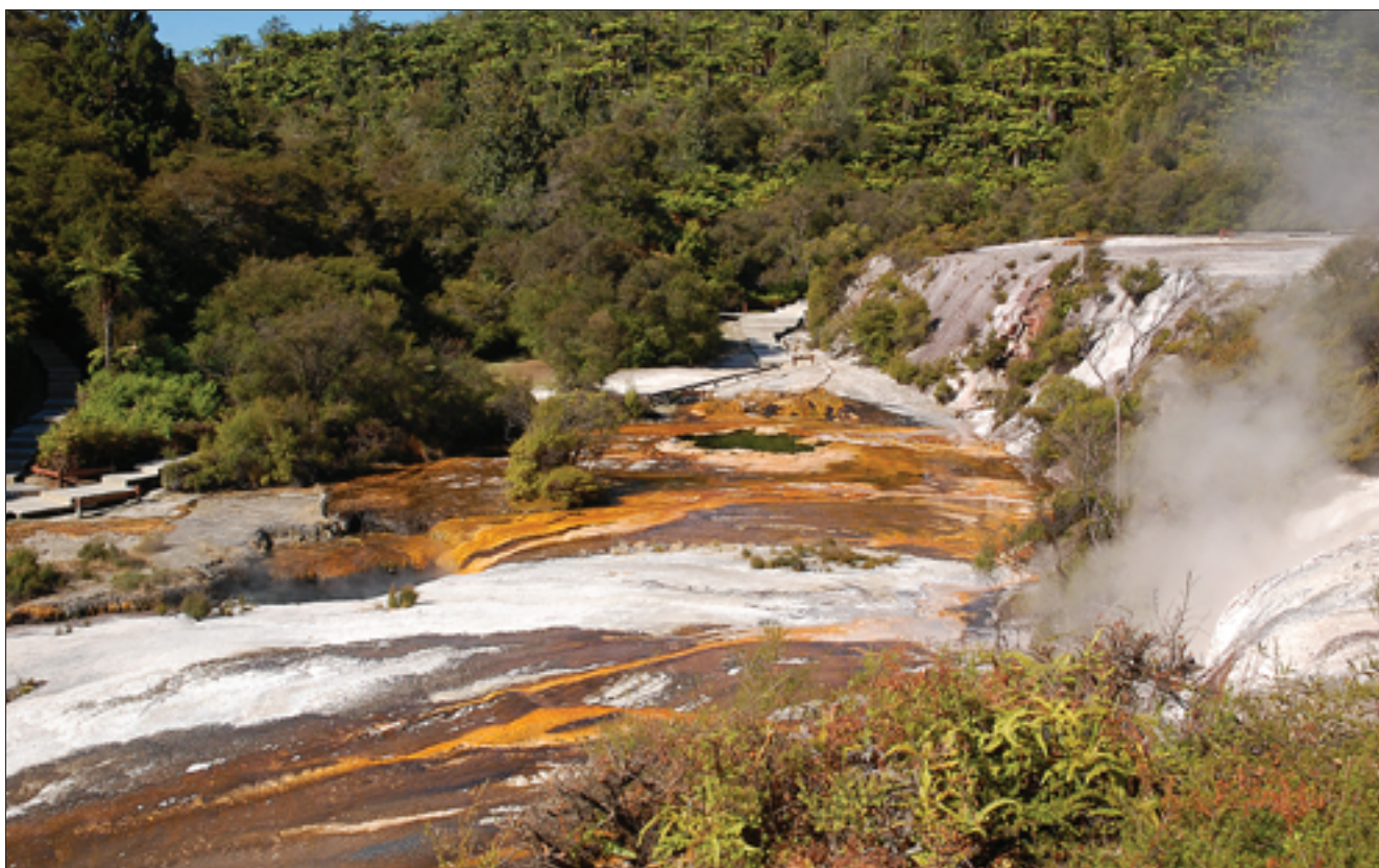
Fig. 16. Silica deposits, hot springs and fumaroles at Orakei Korako, photo P. Migoń • Depozycja krzemionki, gorące źródła i fumarole w Orakei Korako, fot. P. Migoń