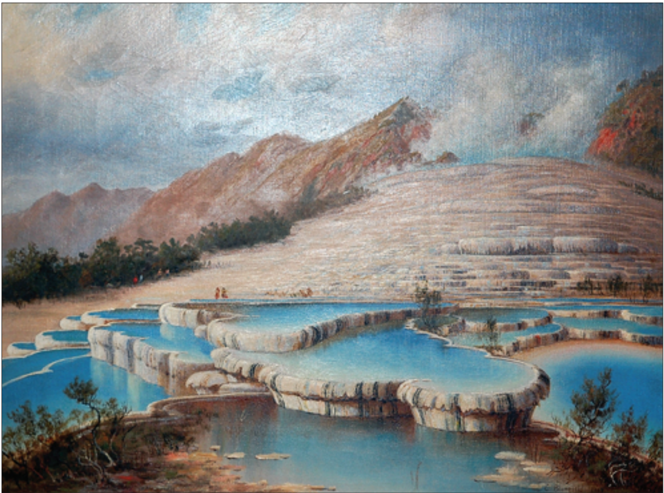
Fig. 2. White Terraces at Lake Rotomahana prior to the eruption of Tarawera volcano, painted by Charles Blomfield. Painting exhibited in the regional museum in Masterton, New Zealand • „Białe tarasy” nad jeziorem Rotomahana przed erupcją wulkanu Tarawera na obrazie autorstwa Charlesa Blomfielda. Obraz wystawiony w muzeum regionalnym w Masterton, Nowa Zelandia

In 2013 c. 3.2 million travellers visited Rotorua, including 1.5 million staying overnight. The average length of a visit is 2.1 days. According to International Visitors Survey ( www.tourismresearch.govt.nz , accessed 08.08.2015), approximately one third were international tourists and 87 per cent among them may be classified as ‘Nature-based’ tourists.