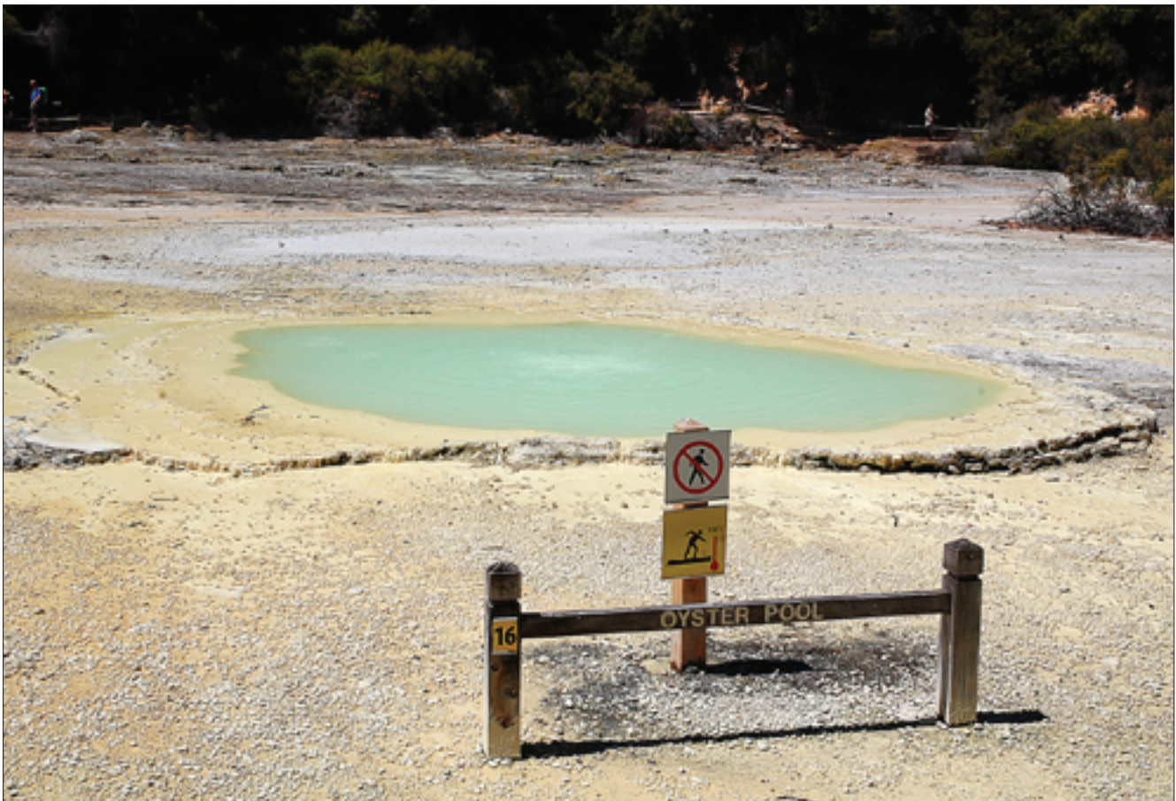
Fig. 21. Simple warning signs for tourists, Wai-O-Tapu • Proste graficzne ostrzeżenia dla turystów, Wai-O-Tapu

At Te Puia Whakarewarewa an opportunity to become acquainted with Maori culture and everyday life, both strongly linked to geothermal phenomena, is emphasized. This is shown by the advertising slogan “New Zealand’s premier Maori centre and home of the world famous Pohutu Geysers” used in promotional leaflets and on website. In each promotional material Maori symbols, particularly elaborate carvings, are presented jointly with geothermal features, mainly spectacular geyser eruptions. In fact, the Living Maori Village Whakarewarewa uses a very similar combination of symbols.