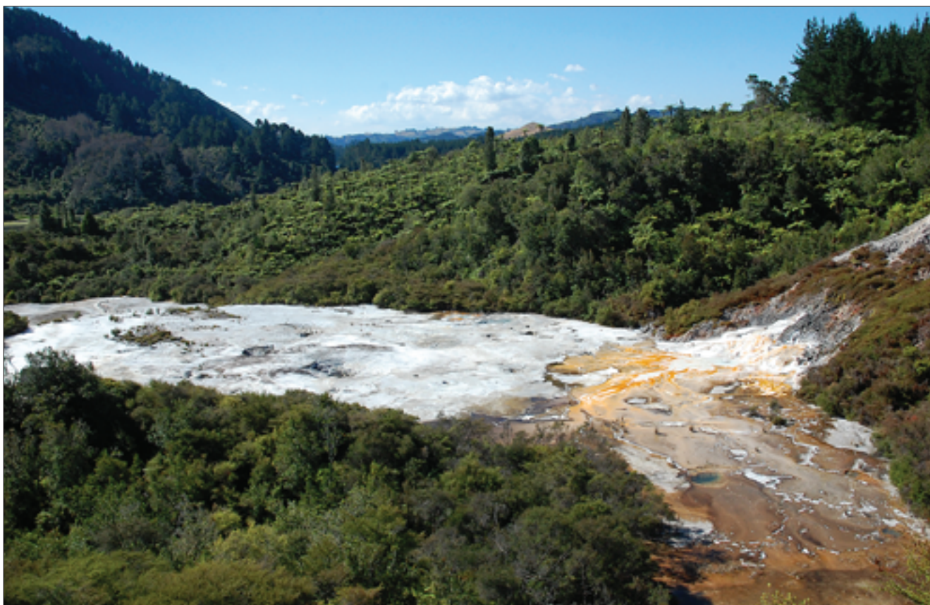
Fig. 14. Overview of Orakei Korako property, with elongated deposition zone of silica • Ogólny widok stanowiska Orakei Korako z wydłużoną strefą akumulacji krzemionki