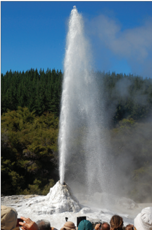
Fig. 12. Lady Knox Geyser during artificially induced eruption • Gejzer Lady Knox podczas sztucznie wywołanej erupcji