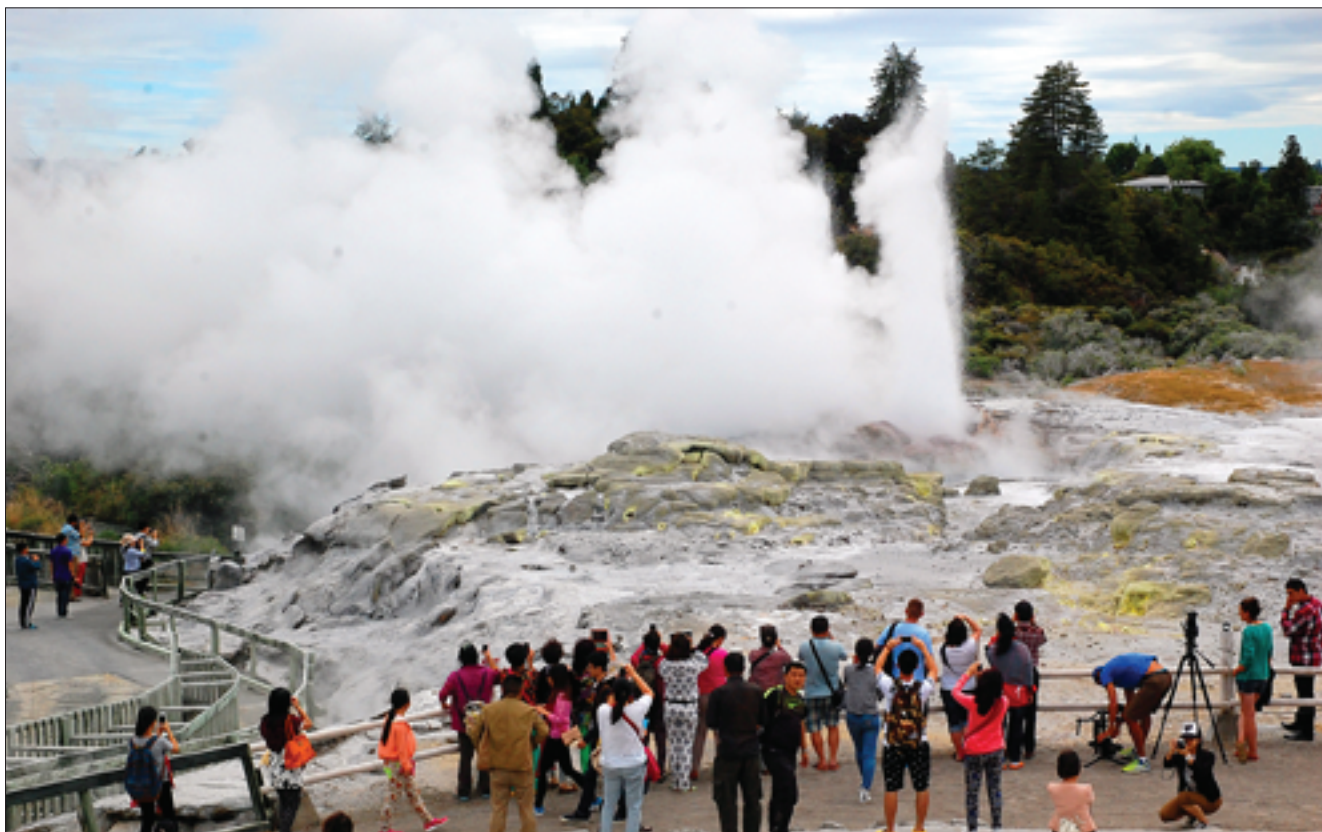
Fig. 4. Regular eruptions of the Pohutu Geyser are the main highlight of Te Puia geothermal site in Rotorua • Regularne erupcje gejzeru Pohutu jako główna atrakcja stanowiska geotermalnego Te Puia w Rotorua