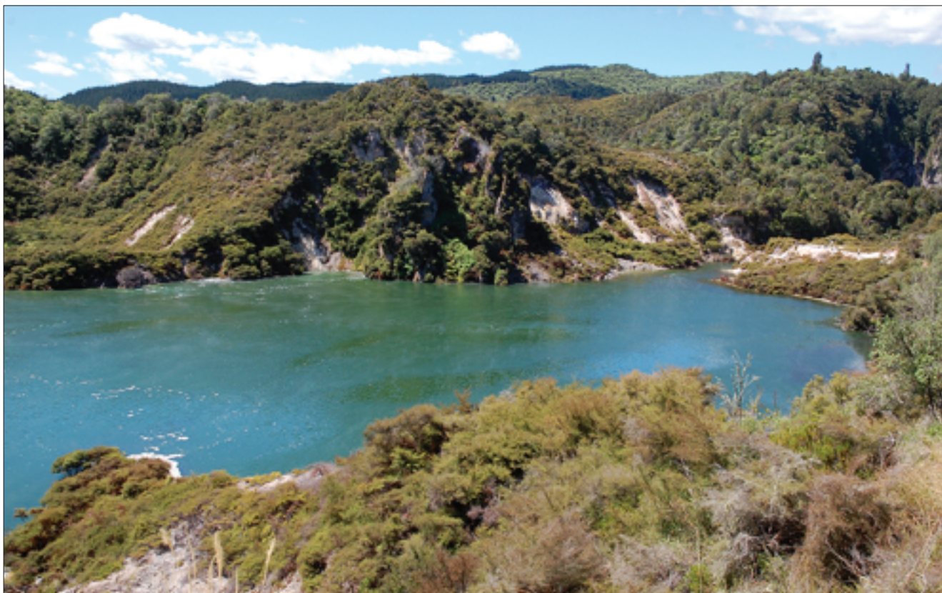
Fig. 6. Frying Pan Lake in Waimangu Volcanic Valley, with cliffs of Cathedral Rocks in the background, photo P. Migoń • Gorące jezioro Frying Pan w wulkanicznej dolinie Waimangu, z urwiskami Cathedral Rocks w tle, fot. P. Migoń