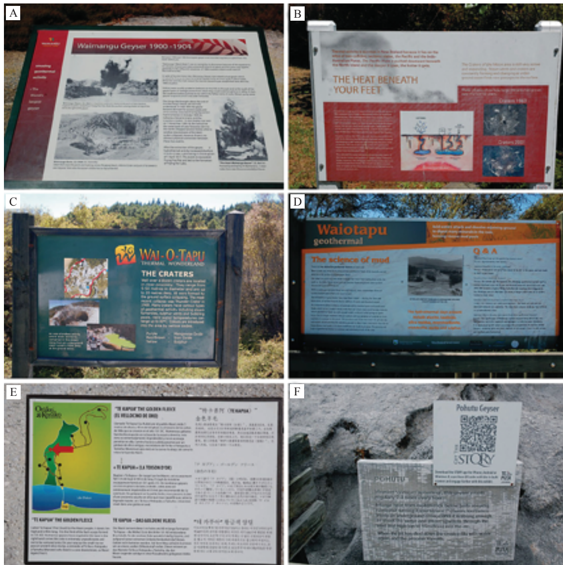
Fig. 22. Examples of information/interpretation boards from different geothermal sites. A – elaborate and informative panel in Waimangu Volcanic Valley, detailing history of Waimangu Geyser; B – panel at Craters of the Moon introduces diversity of geothermal phenomena, at the site and in general; C – explanation of crater origin, Wai-O-Tapu; D – informative panel at Mud Pool, Wai-O-Tapu; E – multilingual but otherwise very simple information board at Orakei Korako – one of more than ten scattered across the property; F – simple and least attractive information panel about Pohutu Geyser at Te Puia, all photos P. Migoń • Przykłady tablic informacyjnych z różnych obiektów geotermalnych Nowej Zelandii. A – obszerna treściowo tablica z wulkanicznej doliny Waimangu prezentująca historię gejzeru Waimangu; B – tablica w Craters of the Moon wprowadzająca w problematykę różnorodności zjawisk geotermalnych w odniesieniu do obiektu i ogólnie; C – wyjaśnienie genezy kraterów, Wai-O-Tapu; D – tablica informacyjna przy Mud Pool, Wai-O-Tapu; E – wielojęzyczna, bardzo prosta pod względem graficzno-trześciowym tablica informacyjna w Orakei Korako – jedna z kilkunastu umieszczonych wzdłuż ścieżki; F – prosta i niezbyt atrakcyjna tablica informacyjna przy gejerze Pohutu w Te Puia, wszystkie fotografie P. Migoń

Likewise, websites are marginally used to enhance learning experience and very little scientific or popular science content is available. ‘Geothermal Valley’ bookmark in Te Puia website does contain photographs of all features of geoscientific interest accompanied by short descriptions, but only two of them – geysers and mud pools – are explained in more detail. No general explanation of geothermal phenomena is provided by either Waimangu, Wai-O-Tapu and Craters of the Moon websites, although individual landforms are briefly described. ‘Waimangu News’ is a bookmark to inform about recent research in the area, but communications