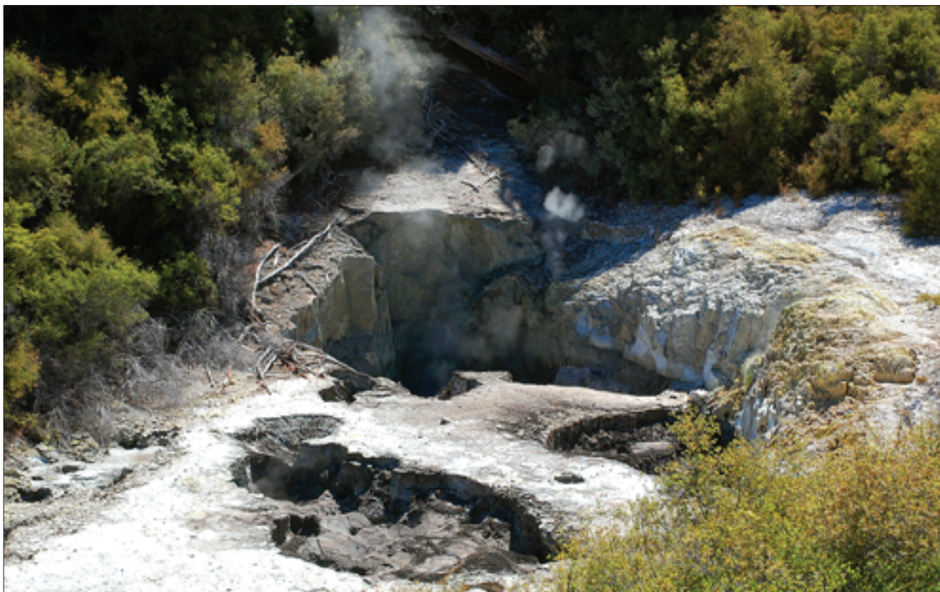
Fig. 9. Devil's Ink Pot – a group of hydrothermal explosion craters at Wai-O-Tapu, photo P. Migoń • “Kałamarze Diabła” – grupa hydrotermalnych kraterów eksplozywnych w Wai-O-Tapu, fot. P. Migoń