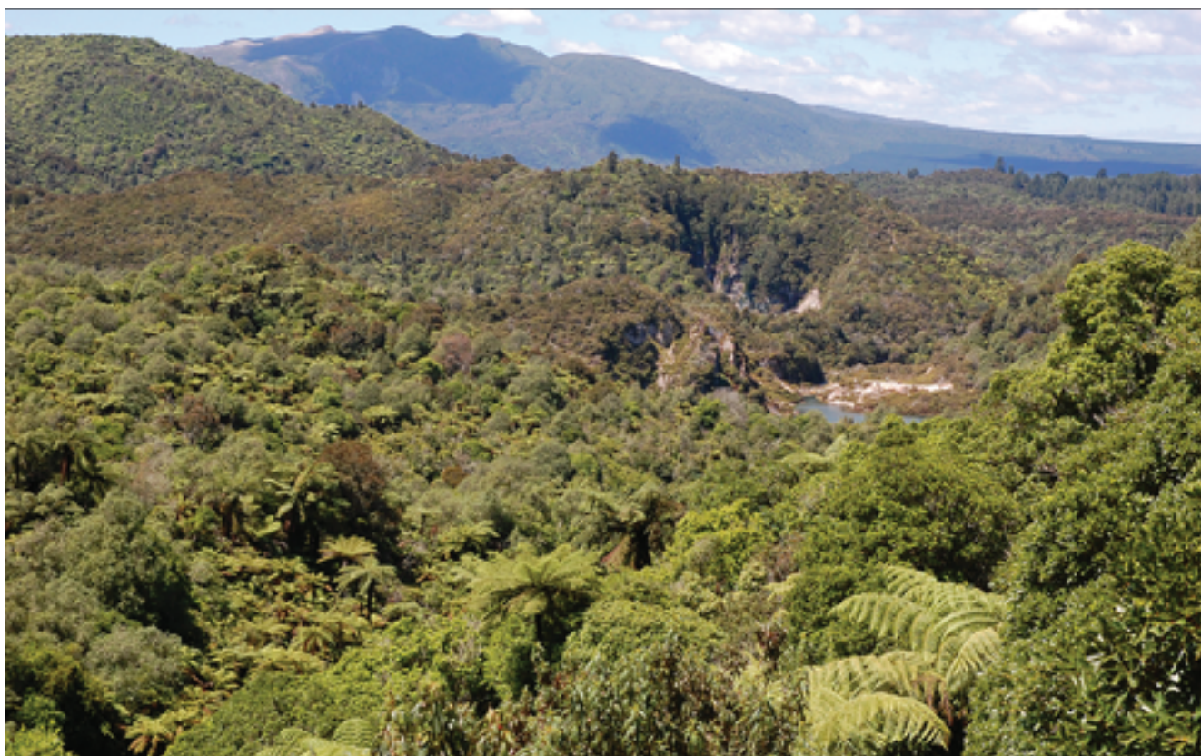
Fig. 5. Overview of Waimangu Volcanic Valley. Echo Crater with Frying Pan Lake in the lower right, with Inferno Crater above. The background of the scene is provided by the Tarawera volcano that violently erupted in June 1886 • Ogólny widok wulkanicznej doliny Waimangu. Echo Crater z jeziorem Frying Pan u dołu po prawej, krater Inferno znajduje się powyżej. Na ostatnim planie wulkan Tarawera, słynny z potężnej eksplozji w czerwcu 1886 r.