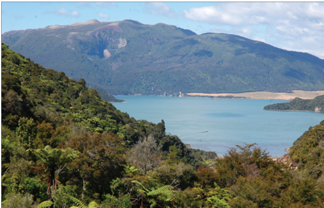
Fig. 8. Lake Rotomahana and the dome of Tarawera volcano in the background. Remnants of White and Pink Terraces have been found on the lake bottom • Jezioro Rotomahana i kopuła wulkanu Tarawera w tle. Pozostałości Białych i Różowych Tarasów zostały odnaleziona na dnie jeziora