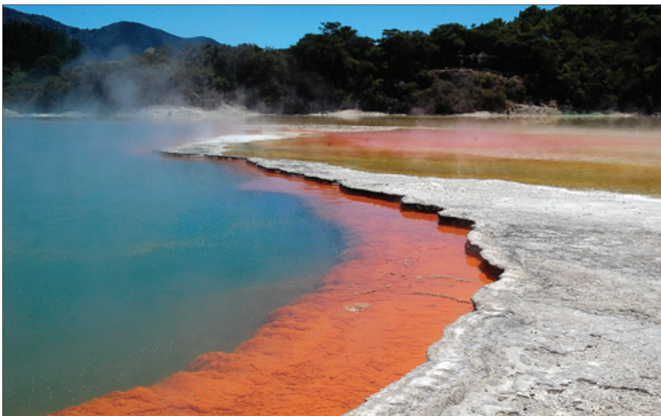
Fig. 10. Raised silica rims along the hot spring of Champagne Pool, Wai-O-Tapu, photo P. Migoń • Podwyższone krawędzie utworzone przez osad krzemionkowy wokół gorącego źródła Champagne Pool w Wai-O-Tapu, fot. P. Migoń