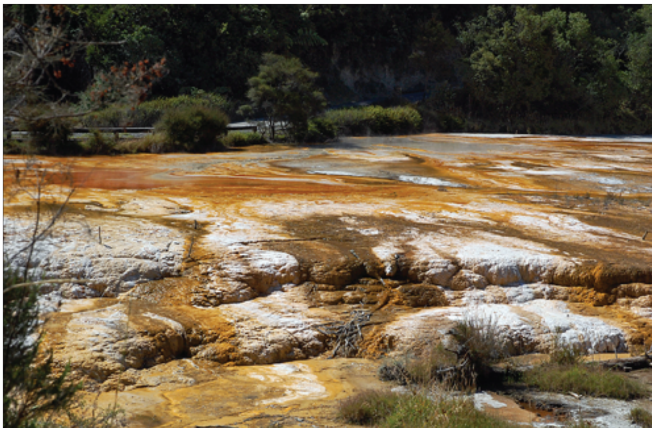
Fig. 7. Valley floor silica terraces in Waimangu Volcanic Valley • Terasy krzemionkowe w dnie doliny w wulkanicznej dolinie Waimangu