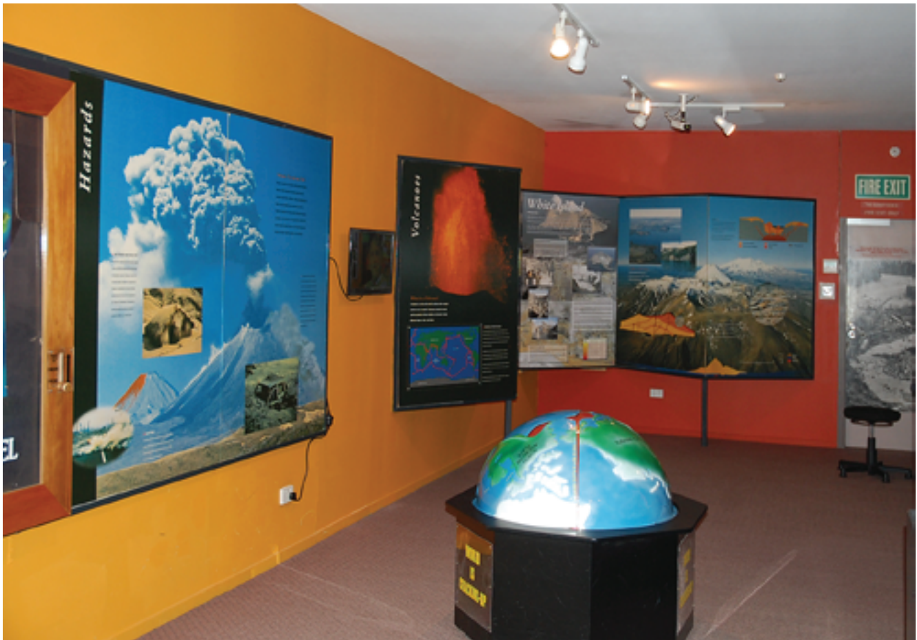
Fig. 23. Volcanic Discovery Centre near Taupo • Ekspozycja w Volcanic Discovery Centre w pobliżu Taupo

Nevertheless, little if any cooperation exists amongst the different properties which apparently compete with each other on the tourist market. Rather, they tend to cooperate with properties offering cultural, thus very different kind of experience (museum, folk shows, adventure tourism). Third, all sites are adequately prepared to receive tourists in large quantities and on-site technical facilities are very well maintained. This is particularly important if one realizes hazards associated with geothermal phenomena.