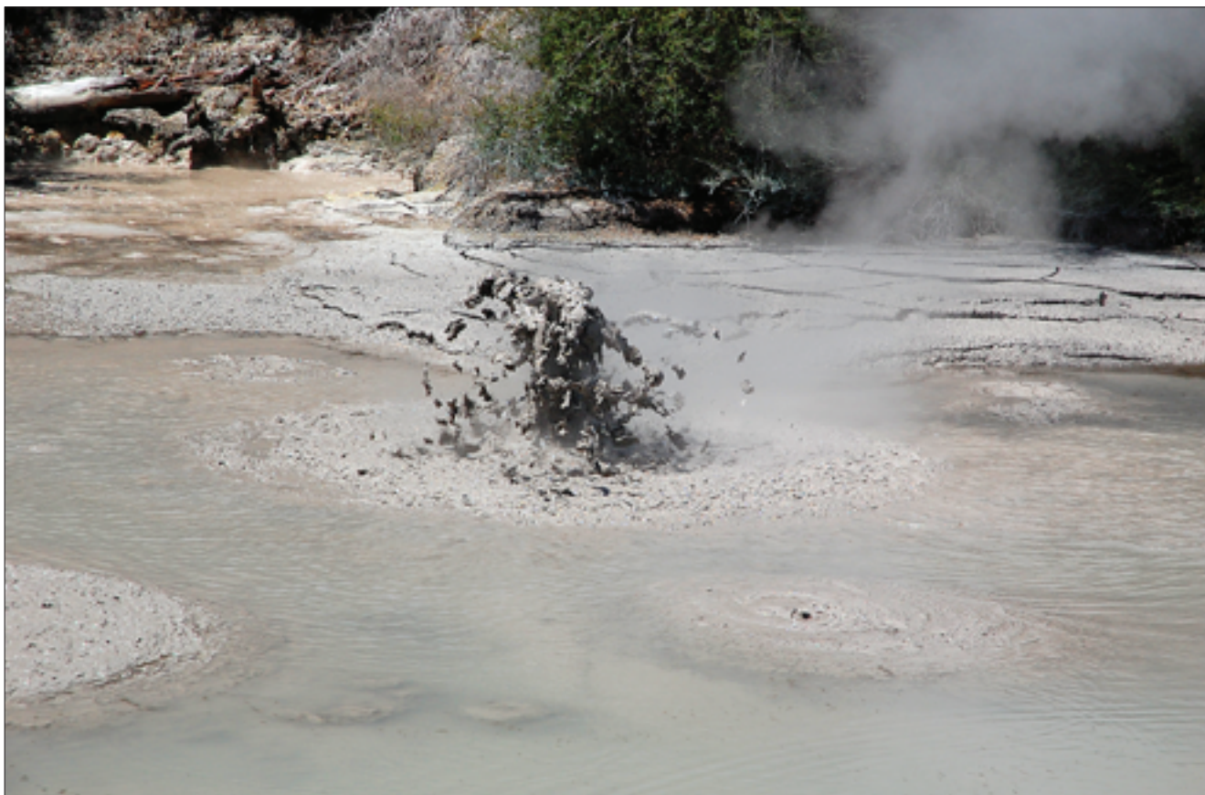
Fig. 13. Mud ejections at Mud Pool, Wai-O-Tapu, photo P. Migoń • Wyrzuty błota w Mud Pool, Wai-O-Tapu, fot. P. Migoń