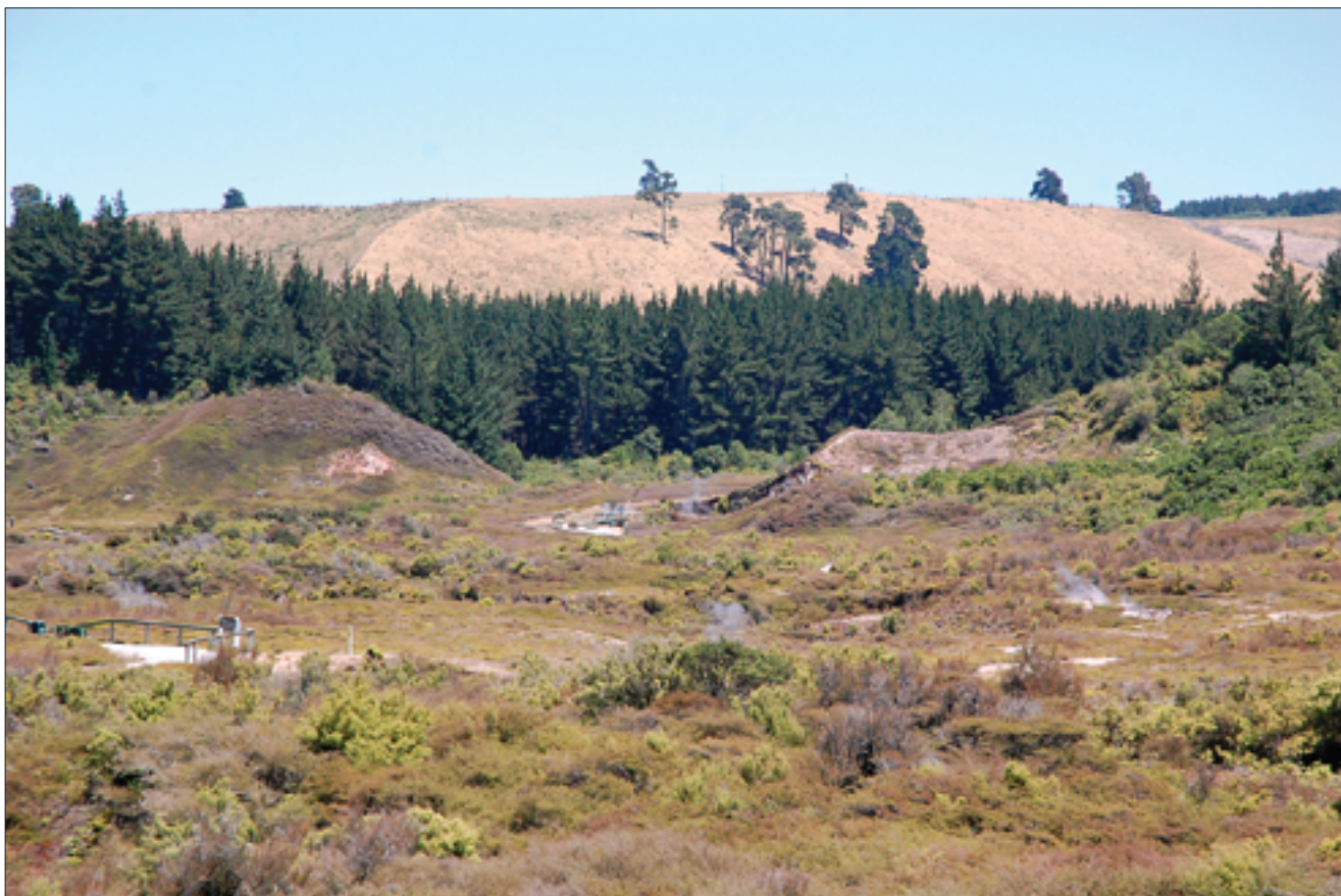
Fig. 17. Craters of the Moon – panoramic view, photo P. Migoń • Panoramiczny widok Craters of the Moon, fot. P. Migoń