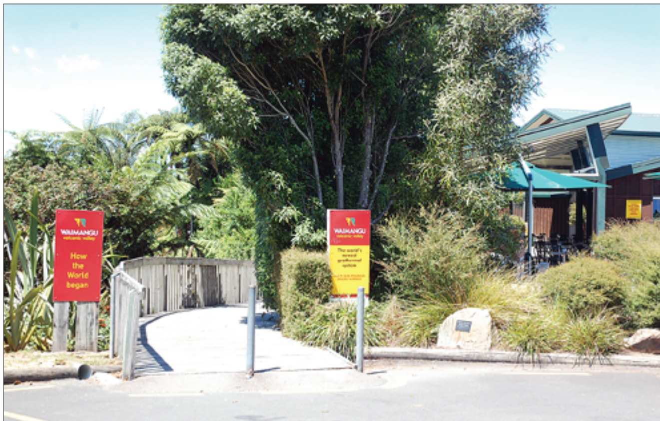
Fig. 19. Entrance to Waimangu Volcanic Valleys, with advertising slogans emphasizing very young age of volcanic and geothermal phenomena • Wejście do wulkanicznej doliny Waimangu, z hasłami reklamowymi podkreślającymi bardzo młody wiek zjawisk wulkanicznych i geotermalnych