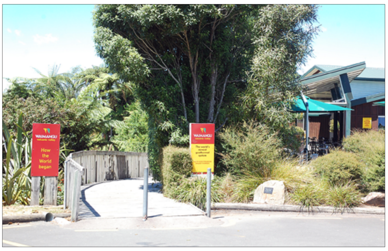
Fig. 19. Entrance to Waimangu Volcanic Valleys, with advertising slogans emphasizing very young age of volcanic and geothermal phenomena, photo P. Migoń • Wejście do wulkanicznej doliny Waimangu, z hasłami reklamowymi podkreślającymi bardzo młody wiek zjawisk wulkanicznych i geotermalnych, fot. P. Migoń