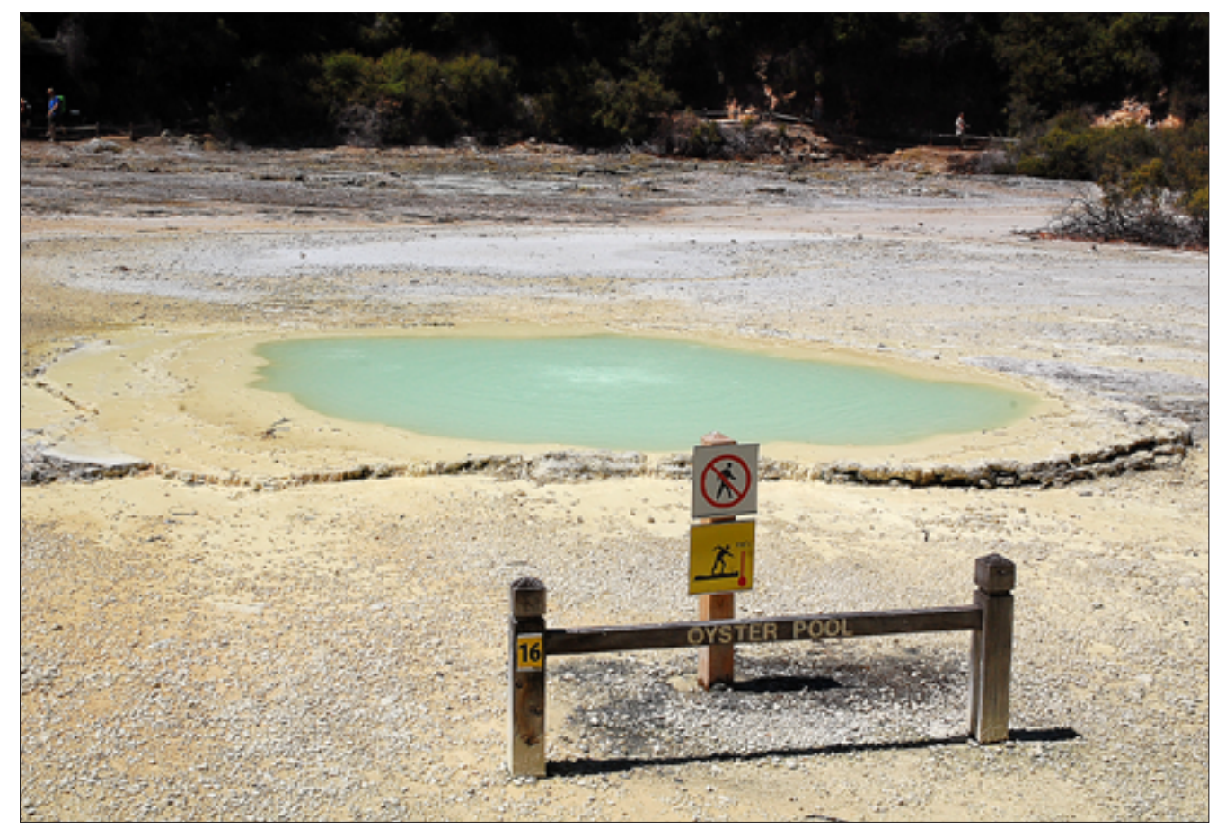
Fig. 20. Simple warning signs for tourists, Wai-O-Tapu • Proste graficzne ostrzeżenia dla turystów, Wai-O-Tapu

At Te Puia Whakarewarewa an opportunity to become acquainted with Maori culture and everyday life, both strongly linked to geothermal phenomena, is emphasized. This is shown by the advertising slogan "New Zealand's premier Maori centre and home of the world famous Pohutu Geyser" used in promotional leaflets and on website. In each promotional material Maori symbols, particularly elaborate carvings, are presented jointly with geothermal features, mainly spectacular geyser eruptions. In fact, the Living Maori Village Whakarewarewa uses a very similar combination of symbols.