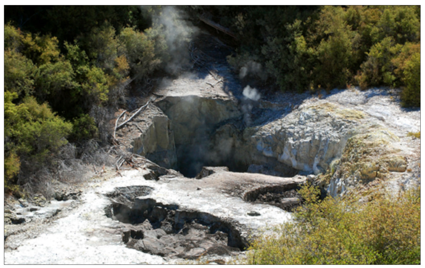
Fig. 9. Devil's Ink Pot – a group of hydrothermal explosion craters at Wai-O-Tapu • "Kałamarze Diabła" – grupa hydrotermalnych kraterów eksplozywnych w Wai-O-Tapu