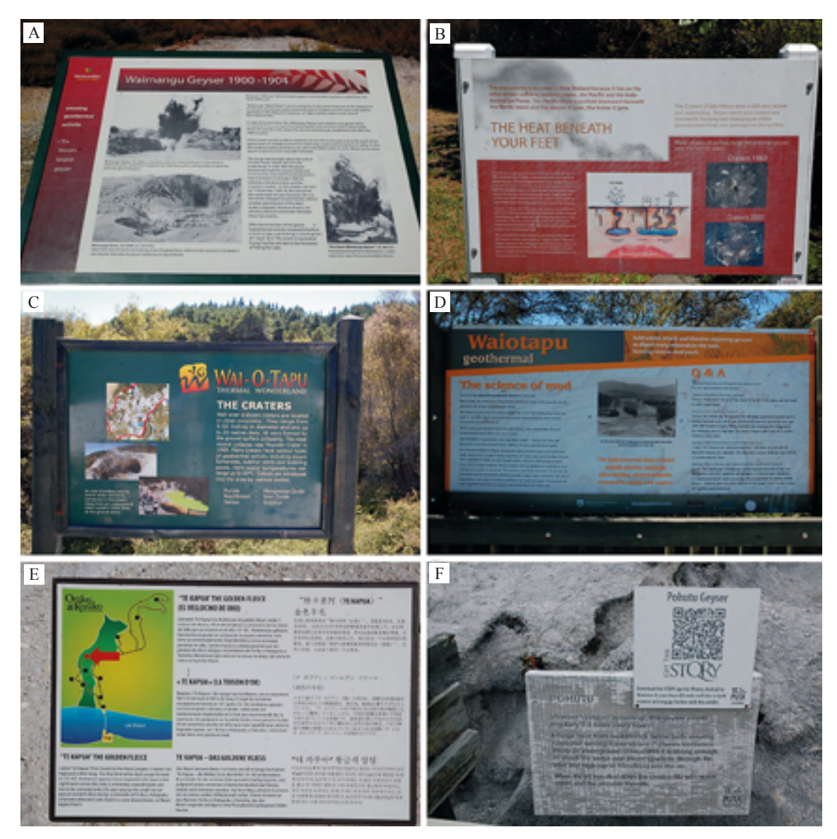
Fig. 22. Examples of information/interpretation boards from different geothermal sites. A – elaborate and informative panel in Waimangu Volcanic Valley, detailing history of Waimangu Geyser; B – panel at Craters of the Moon introduces diversity of geothermal phenomena, at the site and in general; C – explanation of crater origin, Wai-O-Tapu; D – informative panel at Mud Pool, Wai-O-Tapu; E – multilingual but otherwise very simple information board at Orakei Korako – one of more than ten scattered across the property; F – simple and least attractive information panel about Pohutu Geyser at Te Puia, all photos P. Migoń • Przykłady tablic informacyjnych z różnych obiektów geotermalnych Nowej Zelandii. A – obszerna treściowo tablica z wulkanicznej doliny Waimangu prezentująca historię gejzeru Waimangu; B – tablica w Craters of the Moon wprowadzająca w problematykę różnorodności zjawisk geotermalnych w odniesieniu do obiektu i ogólnie; C – wyjaśnienie genezy kraterów, Wai-O-Tapu; D – tablica informacyjna przy Mud Pool, Wai-O-Tapu; E – wielojęzyczna, bardzo prosta pod względem graficzno-treściowym tablica informacyjna w Orakei Korako – jedna z kilkunastu umieszczonych wzdłuż ścieżki; F – prosta i niezbyt atrakcyjna tablica informacyjna przy gejzerze Pohutu w Te Puia, wszystkie fotografie P. Migoń

Likewise, websites are marginally used to enhance learning experience and very little scientific or popular science content is available. 'Geothermal Valley' bookmark in Te Puia website does contain photographs of all features of geoscientific interest accompanied by short descriptions, but only two of them – geysers and mud pools – are explained in more detail. No general explanation of geothermal phenomena is provided by either Waimangu, Wai-O-Tapu and Craters of the Moon websites, although individual landforms are briefly described. 'Waimangu News' is a bookmark to inform about recent research in the area, but communications