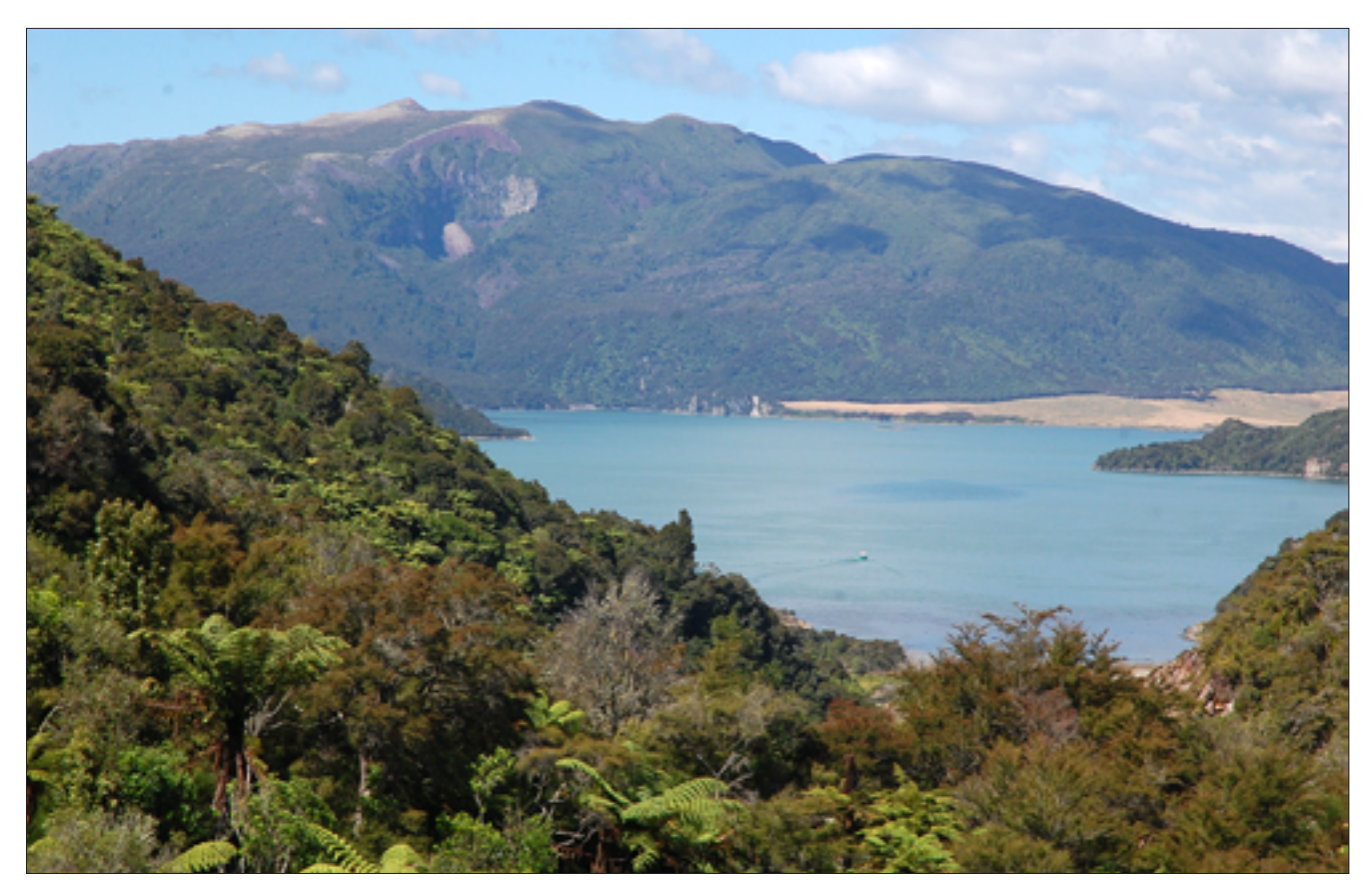
Fig. 8. Lake Rotomahana and the dome of Tarawera volcano in the background. Remnants of White and Pink Terraces have been found on the lake bottom • Jezioro Rotomahana i kopuła wulkanu Tarawera w tle. Pozostałości Białych i Różowych Tarasów zostały odnalezione na dnie jeziora