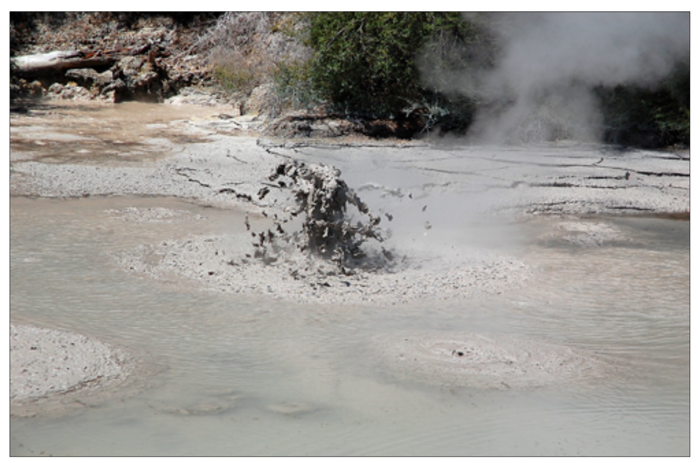
Fig. 13. Mud ejections at Mud Pool, Wai-O-Tapu, photo P. Migoń • Wyrzuty błota w Mud Pool, Wai-O-Tapu, fot. P. Migoń