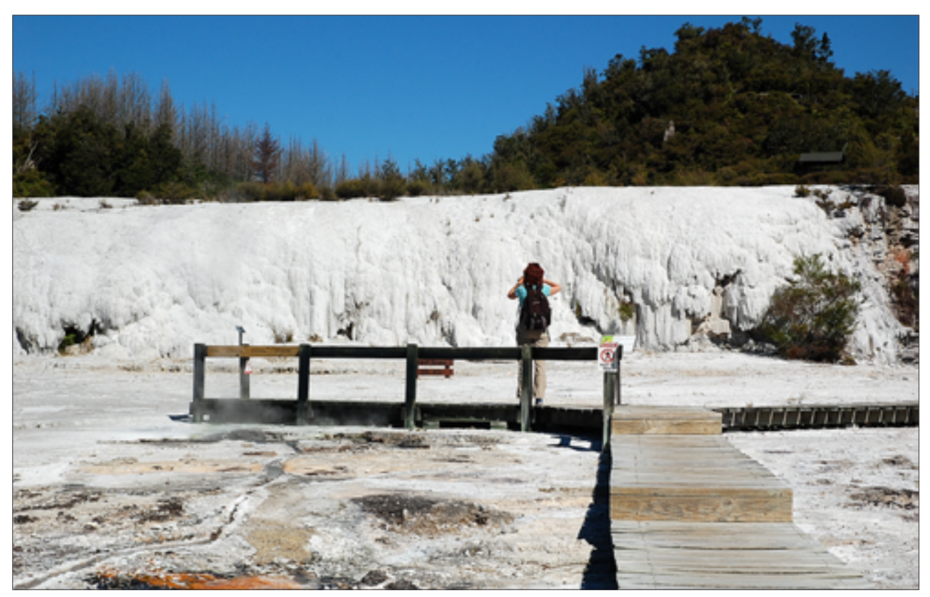
Fig. 15. Silica-covered fault scarp, Orakei Korako Geothermal Park, photo P. Migoń • Skarpa uskokowa pokryta krzemionką wytrąconą z wód hydrotermalnych Orakei Korako Geothermal Park, fot. P. Migoń