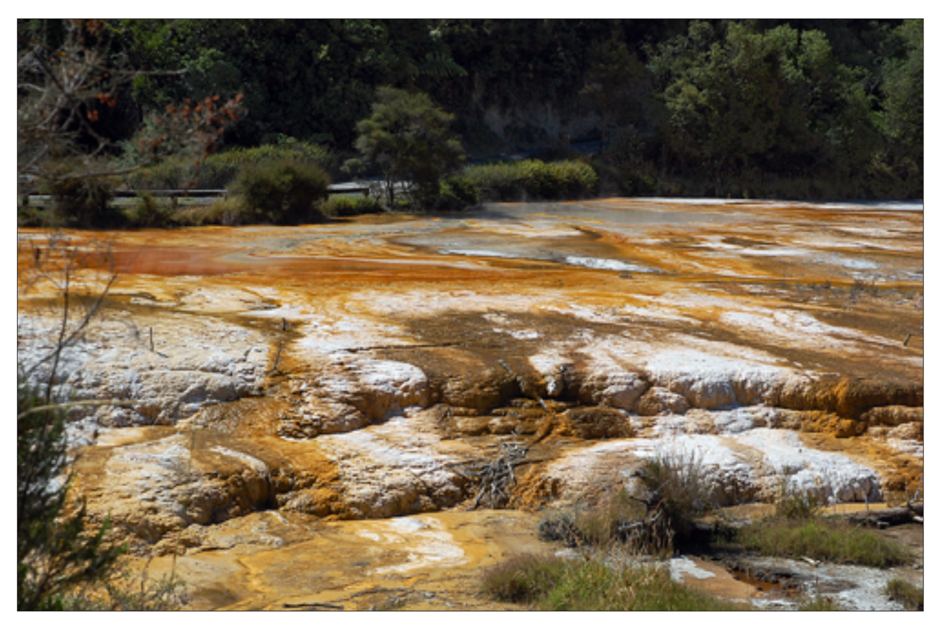
Fig. 7. Valley floor silica terraces in Waimangu Volcanic Valley • Terasy krzemionkowe w dnie doliny w wulkanicznej dolinie Waimangu