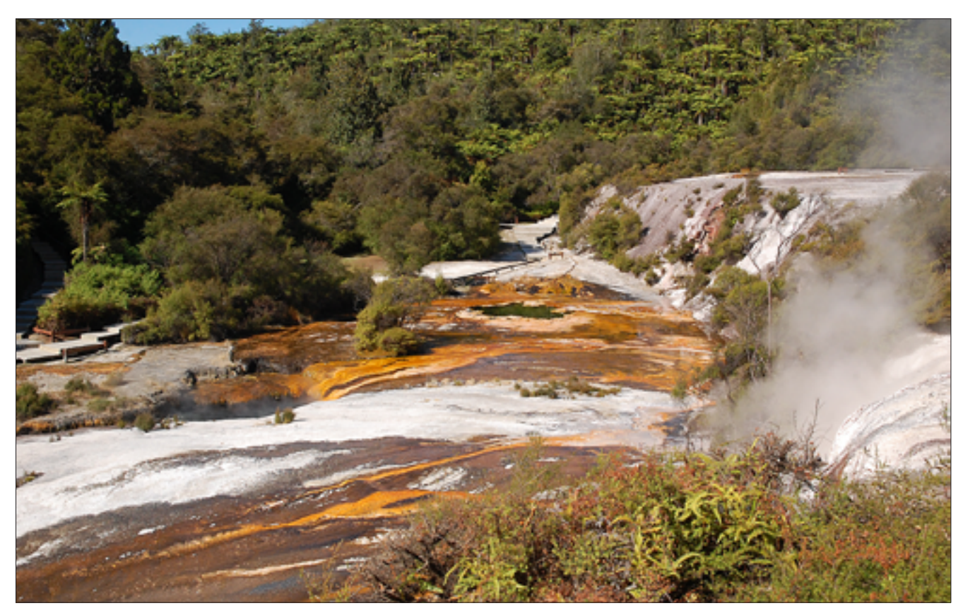
Fig. 16. Silica deposits, hot springs and fumaroles at Orakei Korako, photo P. Migoń • Depozycja krzemionki, gorące źródła i fumarole w Orakei Korako, fot. P. Migoń