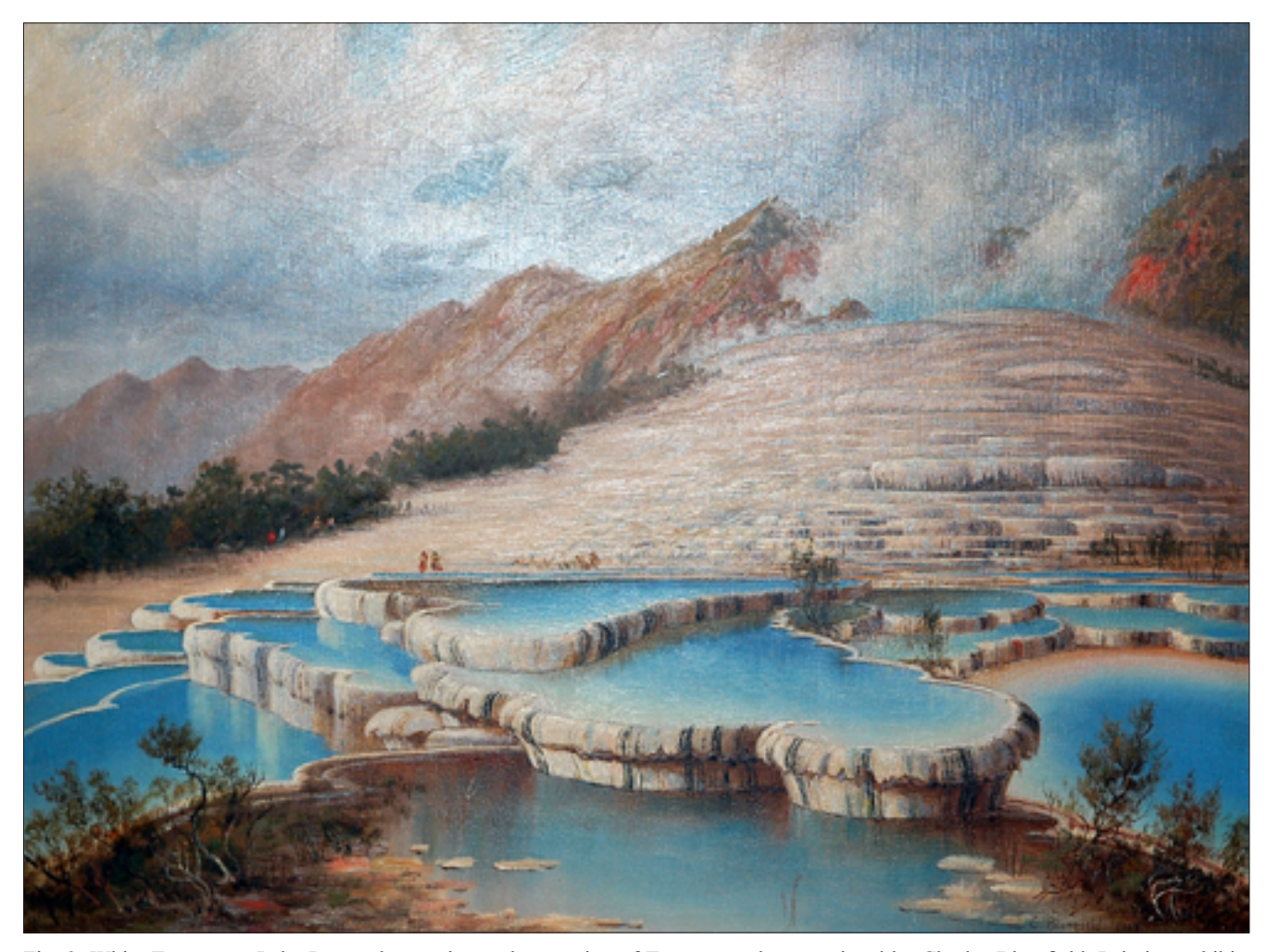
Fig. 2. White Terraces at Lake Rotomahana prior to the eruption of Tarawera volcano, painted by Charles Blomfield. Painting exhibited in the regional museum in Masterton, New Zealand • "Białe tarasy" nad jeziorem Rotomahana przed erupcją wulkanu Tarawera na obrazie autorstwa Charlesa Blomfielda. Obraz wystawiony w muzeum regionalnym w Masterton, Nowa Zelandia

In 2013 c. 3.2 million travellers visited Rotorua, including 1.5 million staying overnight. The average length of a visit is 2.1 days. According to International Visitors Survey (www.tourismresearch.govt.nz, accessed 08.08.2015), approximately one third were international tourists and 87 per cent among them may be classified as 'Nature-based' tourists.