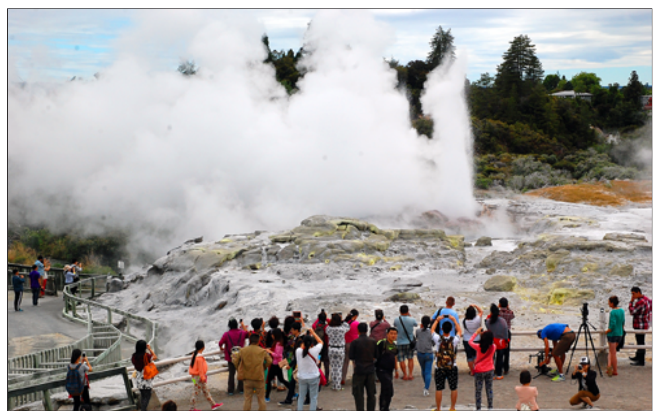
Fig. 4. Regular eruptions of the Pohutu Geyser are the main highlight of Te Puia geothermal site in Rotorua • Regularne erupcje gejzeru Pohutu jako główna atrakcja stanowiska geotermalnego Te Puia w Rotorua