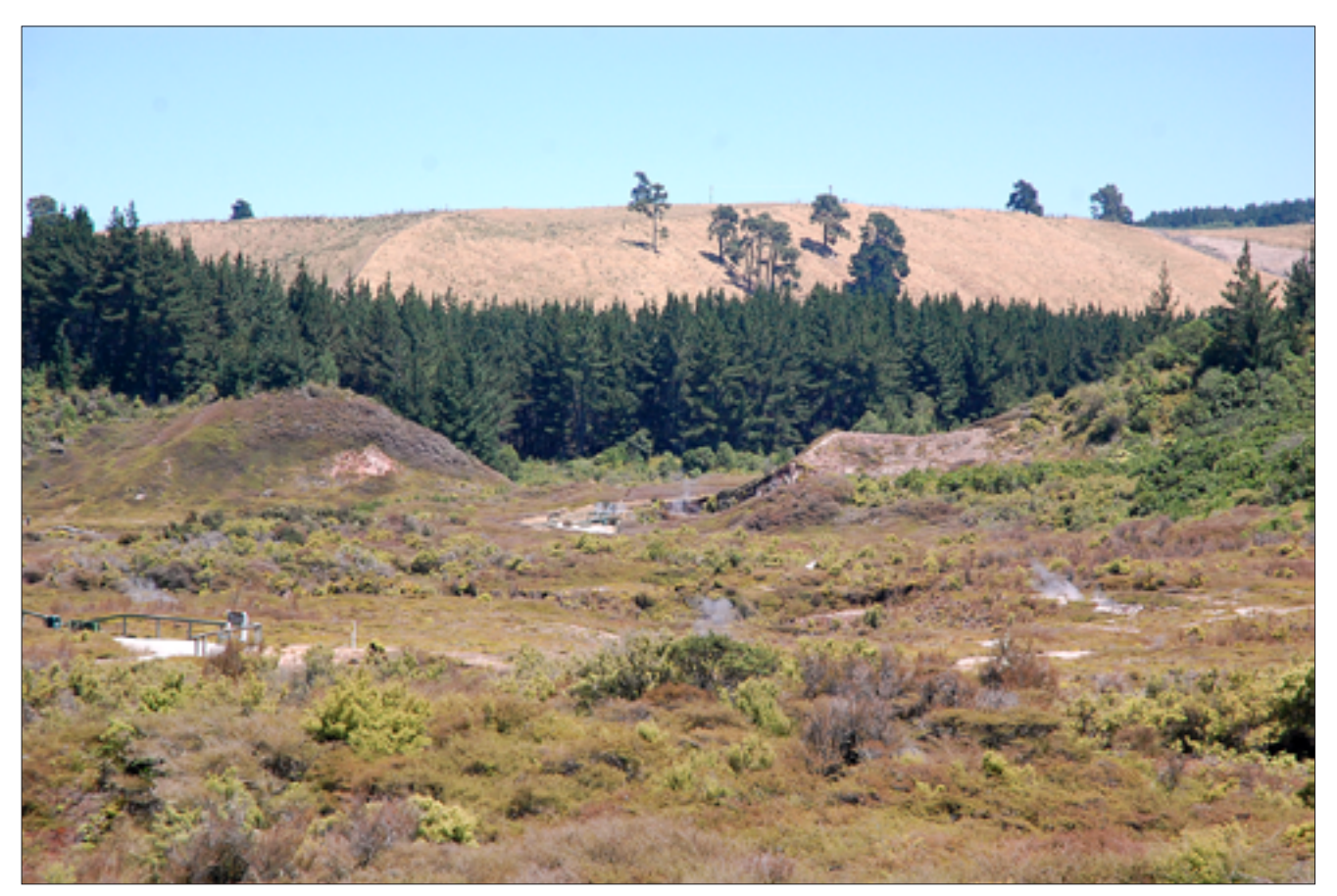
Fig. 17. Craters of the Moon - panoramic view • Panoramiczny widok Craters of the Moon