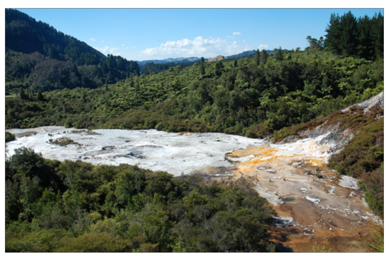
Fig. 14. Overview of Orakei Korako property, with elongated deposition zone of silica • Ogólny widok stanowiska Orakei Korako z wydłużoną strefą akumulacji krzemionki