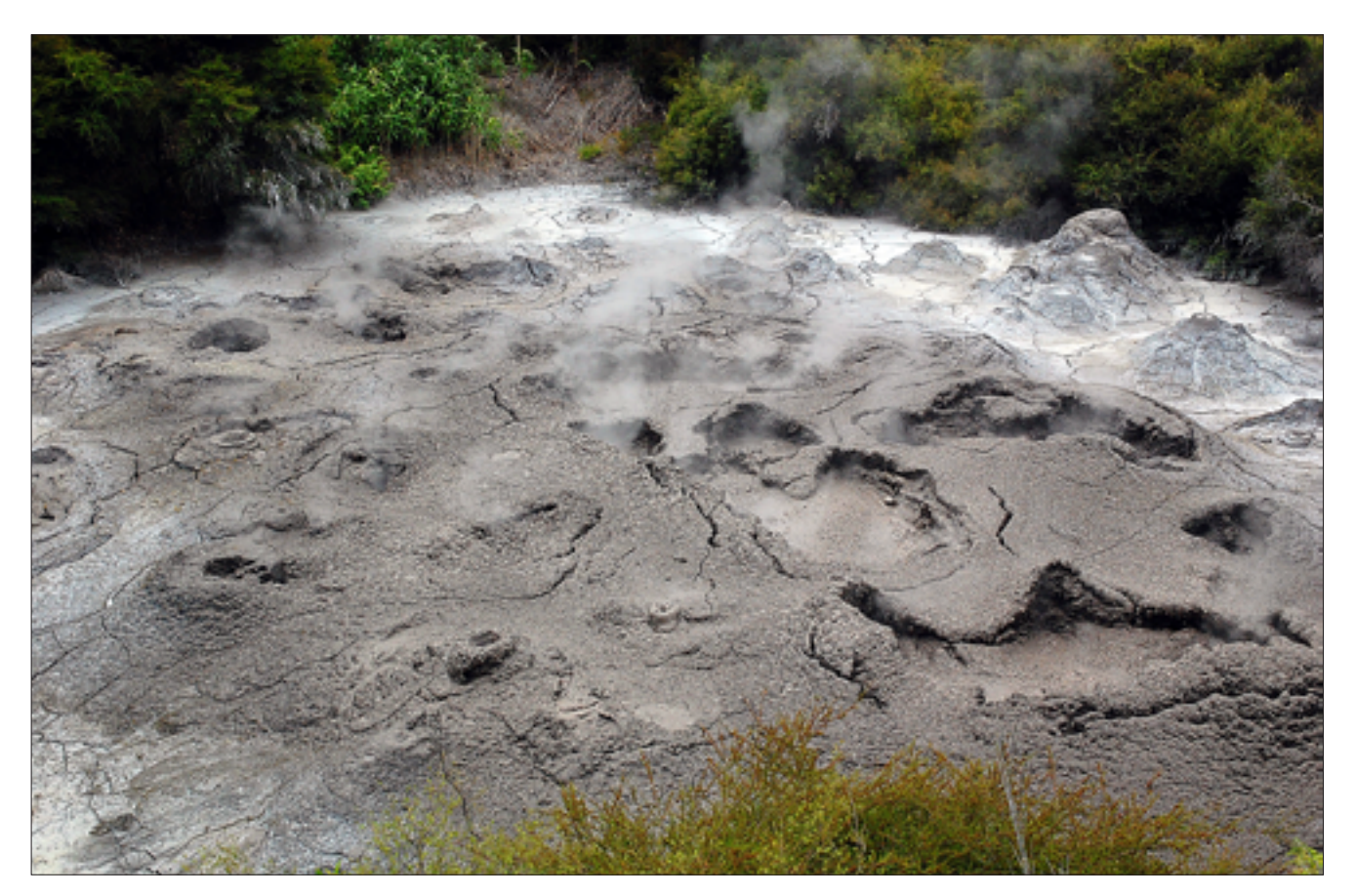
Fig. 3. Extremely active mud pool at Te Puia, Rotorua, photo P. Migoń • Wyjątkowo aktywna sadzawka błotna w Te Puia, Rotorua, fot. P. Migoń

The post-1886 eruption recovery of vegetation provides an opportunity to see many species of native flora, including ferns, kanuka, thermophilous mosses and algae. The site is also connected with Maori history and the history of tourism. Its heydays prior to 1886, to see the Pink and White Terraces, and then in 1900–1904 to witness explosions of the Waimangu Geyser, are recalled on boards throughout the site.