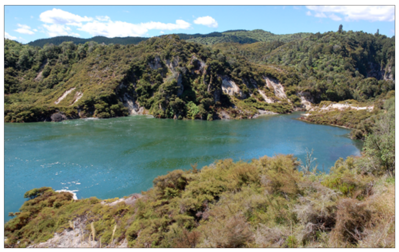
Fig. 6. Frying Pan Lake in Waimangu Volcanic Valley, with cliffs of Cathedral Rocks in the background • Gorące jezioro Frying Pan w wulkanicznej dolinie Waimangu, z urwiskami Cathedral Rocks w tle