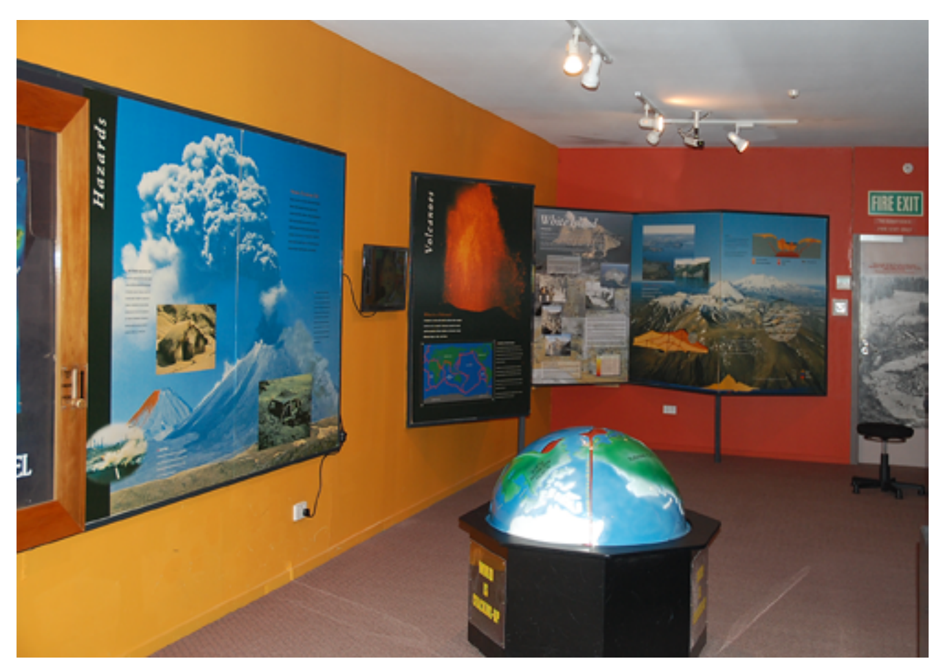
Fig. 23. Volcanic Discovery Centre near Taupo, photo P. Migoń • Ekspozycja w Volcanic Discovery Centre w pobliżu Taupo, fot. P. Migoń

Nevertheless, little if any cooperation exists amongst the different properties which apparently compete with each other on the tourist market. Rather, they tend to cooperate with properties offering cultural, thus very different kind of experience (museum, folk shows, adventure tourism). Third, all sites are adequately prepared to receive tourists in large quantities and on-site technical facilities are very well maintained. This is particularly important if one realizes hazards associated with geothermal phenomena.