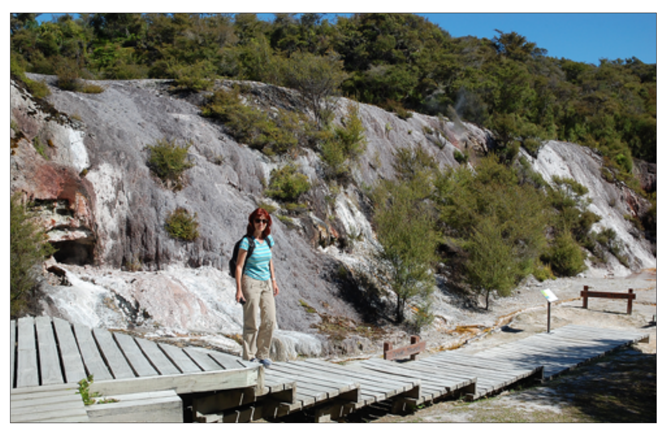
Fig. 20. Wooden boardwalks at Orakei Korako • Drewniane pomosty dla odwiedzających w Orakei Korako