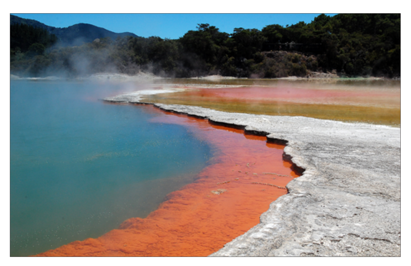
Fig. 10. Raised silica rims along the hot spring of Champagne Pool, Wai-O-Tapu, photo P. Migoń • Podwyższone krawędzie utworzone przez osad krzemionkowy wokół gorącego źródła Champagne Pool w Wai-O-Tapu, fot. P. Migoń