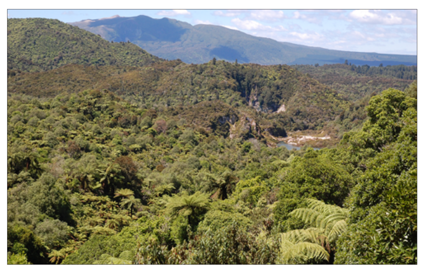
Fig. 5. Overview of Waimangu Volcanic Valley. Echo Crater with Frying Pan Lake in the lower right, with Inferno Crater above. The background of the scene is provided by the Tarawera volcano that violently erupted in June 1886, photo P. Migoń • Ogólny widok wulkanicznej doliny Waimangu. Echo Crater z jeziorem Frying Pan u dołu po prawej, krater Inferno znajduje się powyżej. Na ostatnim planie wulkan Tarawera, słynny z potężnej eksplozji w czerwcu 1886 r., fot. P. Migoń