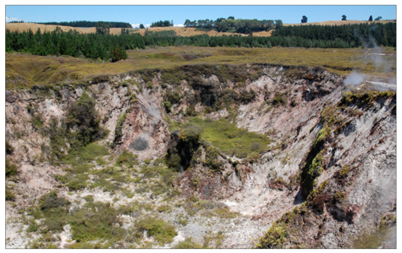
Fig. 18. One of collapse craters in the Craters of the Moon property • Jeden z kraterów zapadliskowych w obszarze Craters of the Moon