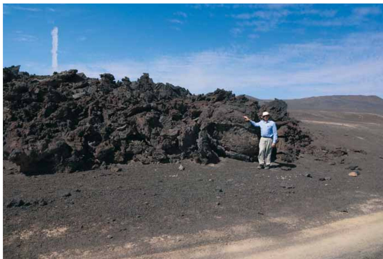
Fig. 10. The face of an aa lava tongue, along the track to the white volcanoes

This type of lava flow that consists of brecciated, sharp broken slabs and fragments of rock is termed “aa” lava (pronounced Ah – Ah). The word is borrowed from the Polynesian Hawaiian language, and is possibly derived from the cries of pain that would be emitted by a barefoot traveller as he crosses such a lava flow. The track crosses through the “aa” lava flow, and proceeds through a lapilli field to the next lava flow.