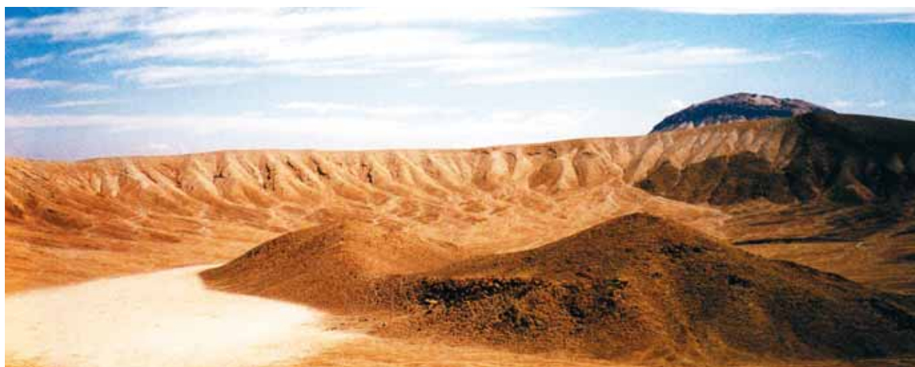
Fig. 20. View into the crater of Jabal al Bayda, showing the smaller cinder cone in its centre. The top of Jabal Qidr is visible in the distance

From this high point, the track leads down the opposite side of Jabal Bayda, around the darker volcano, and down into a wadi (the Arabic word for “gully”) that is paved with light-coloured alluvium from Jabal Bayda. At this location, the visitor is surrounded by volcanic features. At one point along the wadi, we see a stream of black lava that seems to have overflowed from the lava field, and ran down the side of the wadi like some molten stream of dark chocolate (Fig. 21). At another point along the wadi (N25°, 40.45', E39° 55.38'), igneous intrusions on the flanks of the volcano show textbook examples of columnar jointing (Figs 22, 23) – though the columns are much smaller than those seen in roadcuts along Highway 15.