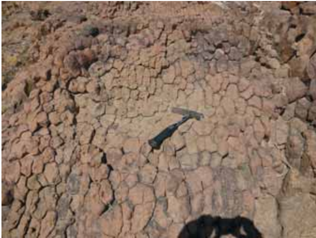
Fig. 23. Detail of Figure 22. Hammer for scale

From this point, the desert tracks bifurcate and anastomose through a nearly impassible desert pavement that is comprised of tyre-eating sharp fragments of basaltic rock. After visiting the wadi on the south side of Jabal Bayda, the visitor is advised to either prepare a campsite, or turn back and retrace his route and return to the paved road leading back to Ath Thamad.