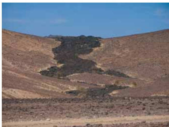
Fig. 21. A stream of lava which overflowed into the wadi SE of Jabal al Bayda, photo M. Kamiński