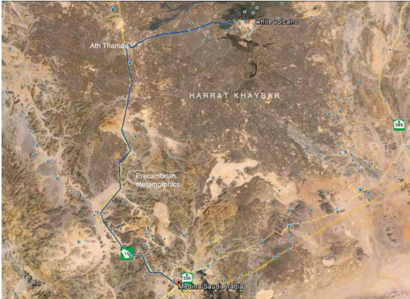
Fig. 1. Google Earth image of the area north of Al-Madinah, showing the areal extent of the volcanic Harrat Khaybar with the white and black volcanoes, photo M. Kamiński