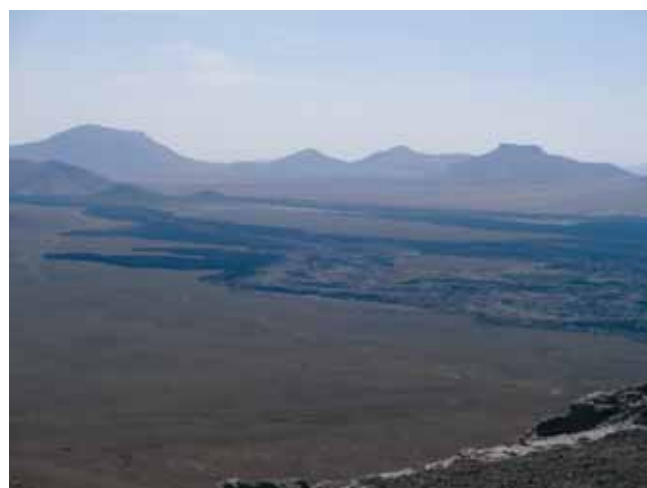
Fig. 9. Basaltic lava field emanating from Jabal Qidr, with the track visible to the front and left of the flows, photo M. Kamiński