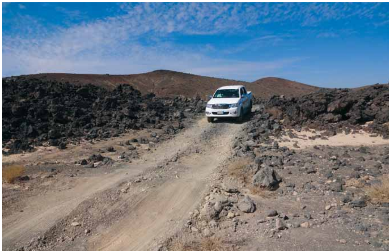
Fig. 13. Exiting the last a lava flow onto desert alluvium derived from the white volcanoes, photo M. Kamiński

Crossing over the track, we observe that in places the top surface of the flow has a “ropy” texture that is caused when the congealing surface crust of the flowing lava is deformed by the flow of a hotter, more fluid lava beneath. As a result of the movement of the lava, the surface crust (or “koziuch”) of the lava is twisted into shapes that resemble curved coils of rope. Such a texture is called “pahoehoe” lava by the Polynesian Hawaiians. Whether a particular lava flow forms an “aa” or “pahoehoe” flow is a function of the composition of the lava as well as its temperature and viscosity.