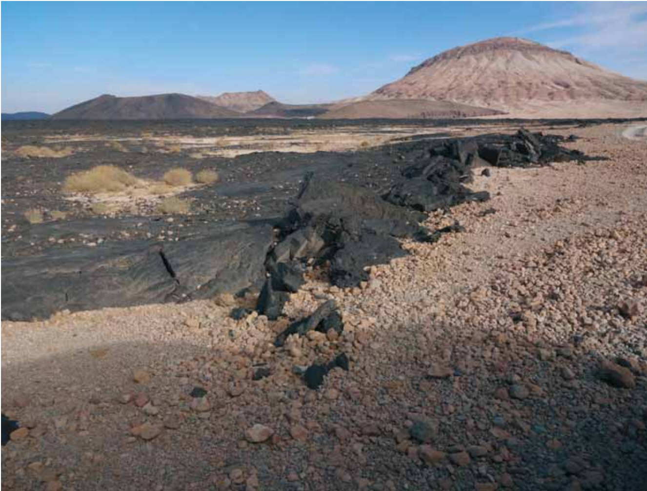
Fig. 16. View of Jabal al Abyad from the south, with the edge of the basaltic lava field in the center and left