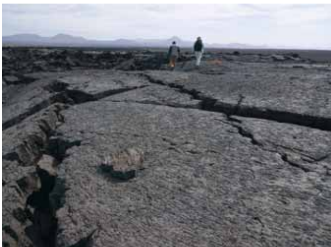
Fig. 4. Glassy surface of a lava flow that meets the main road, 55 km east of Highway 15