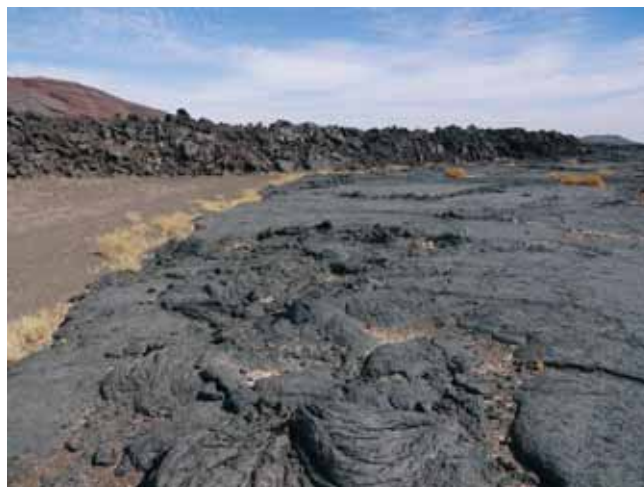
Fig. 12. A blocky aa lava flow superimposed onto the pahoehoe flow, photo M. Kamiński