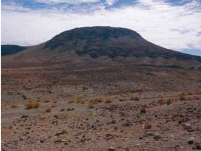
Fig. 15. Jabal al Abyad, with light-coloured desert pavement in the foreground