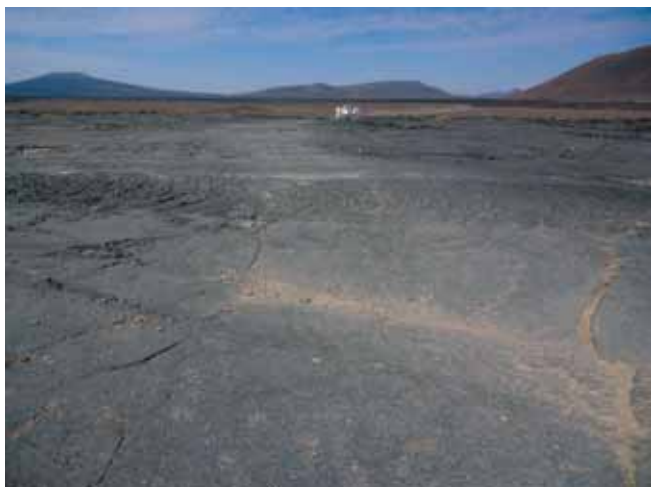
Fig. 11. The track crossing the surface of a pahoehoe lava flow