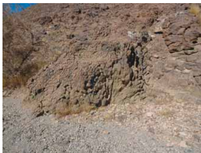
Fig. 22. A dyke of basaltic lava showing small-scale columnar jointing