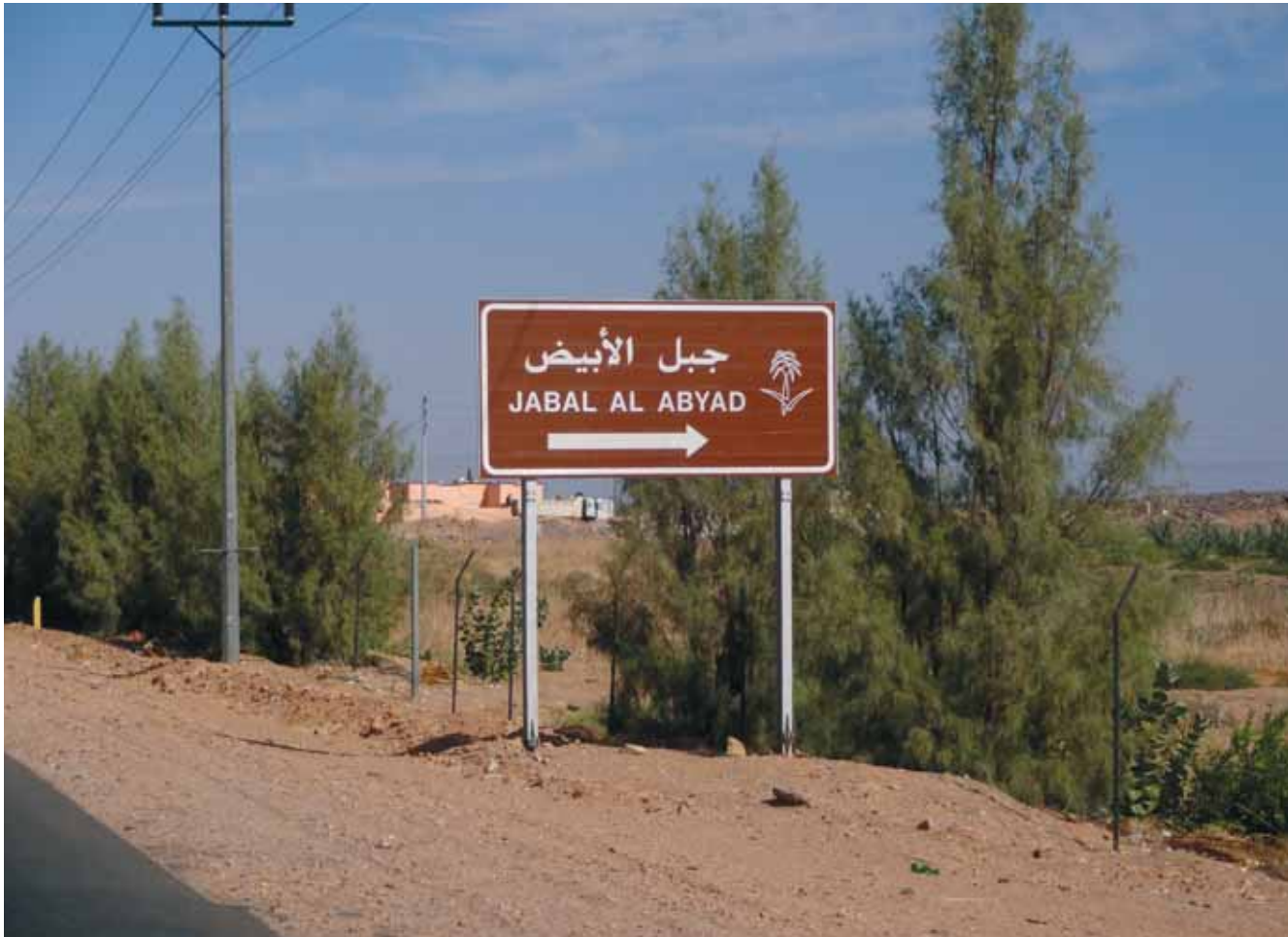
Fig. 3. Road sign on Highway 15 (North) indicating the turn-off for the white volcanoes, photo M. Kamiński