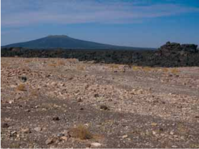
Fig. 14. View toward Jabal Qidr, with the sea of black lava in the middle foreground

Following the track down the hill in the direction of Jabal al Abyad (Figs 15, 16), we see the relative stratigraphy of the various volcanic units, the white ash of Jabal Bayda, the light brown pyroclastics from Jabal al Abyad, and finally the black lavas of Jabal Qidr onlapping onto the alluvium derived from the white volcanoes.