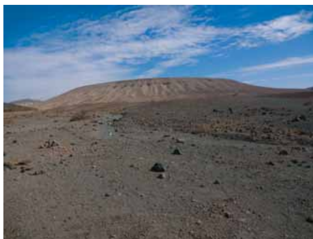
Fig. 19. View of Jabal al Bayda from the southwest

The track now proceeds along the base of Jabal Bayda, keeping the black lava sea on the right side of the track (Figs 17, 18). The rock comprising the cone of Jebel Bayda is classified as comendite, which mainly consists of quartz and albite phenocrysts in a fine groundmass. The rock feels surprisingly light when picked up – almost pumice-like. It is