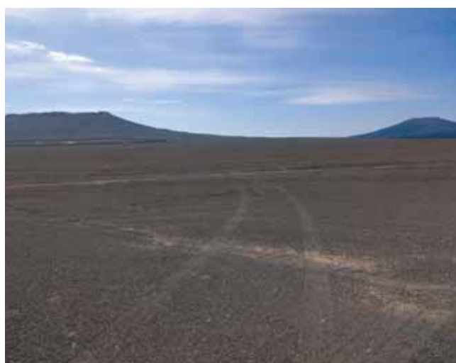
Fig. 7. Lapilli-paved surface of the desert, at the turn-off from the main road. The track leads around the enclosed farm to the cinder cone in the distance, photo M. Kamiński

Proceeding down the hill along the track, continue until the track reaches the lava flow on the right-hand side. The basaltic lava flow forms a wall of sharp, inky black, glassy slabs of rock, some of which stand erect as sentinels (Fig. 10).