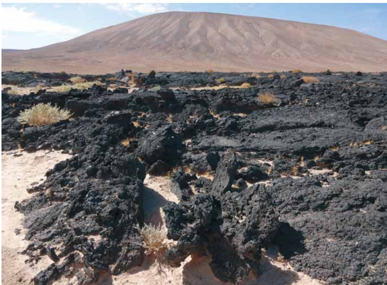
Fig. 17. View of Jabal al Bayda from the north, with black lava from Jabal Qidr at its base