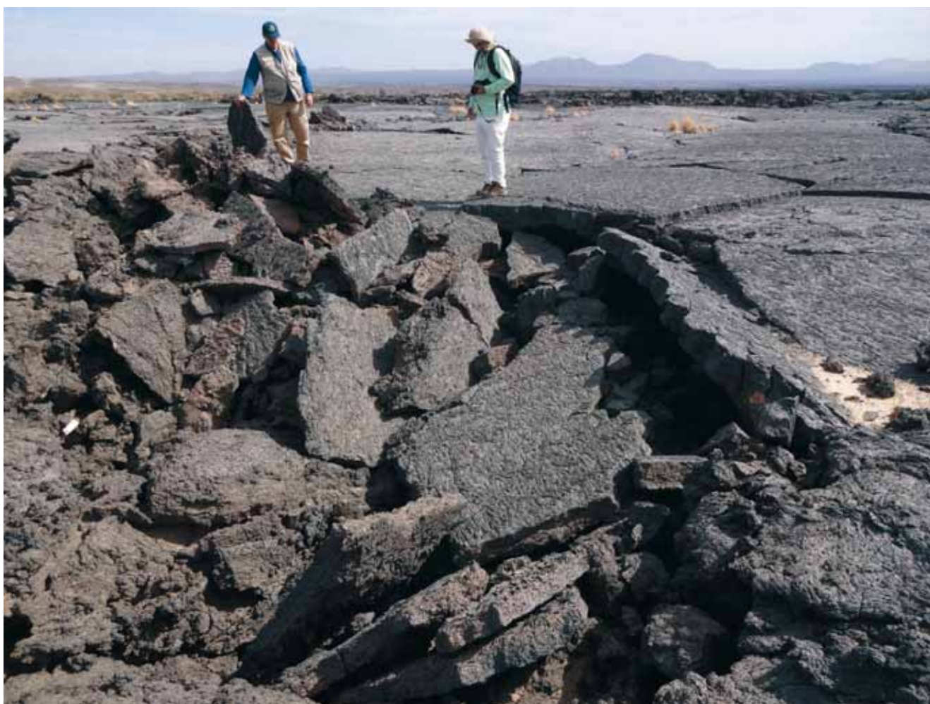
Fig. 6. Collapsed surface of the lava tube

A short stroll along the surface of the lava flow reveals that it is in fact a lava tube, with collapsed “sinkholes” present in places (Fig. 6). The lava flow generally followed the pre-existing topography. At this locality, the white volcanoes become visible in the distance. The distinctive eroded shape of the cream-coloured Jabal al Abyad has been rightfully described as resembling that of a jellyfish. The paved road now continues uphill for a short distance, eventually reaching a track that passes a couple of farms surrounded by earthen (volcanic cinder) enclosures. Follow this track around to the right of the farms and continue around the side of the volcanic cinder cone. At this locality the desert pavement consists of loose, pea-sized, dark grey volcanic lapilli derived from the cinder cone (Fig. 7).