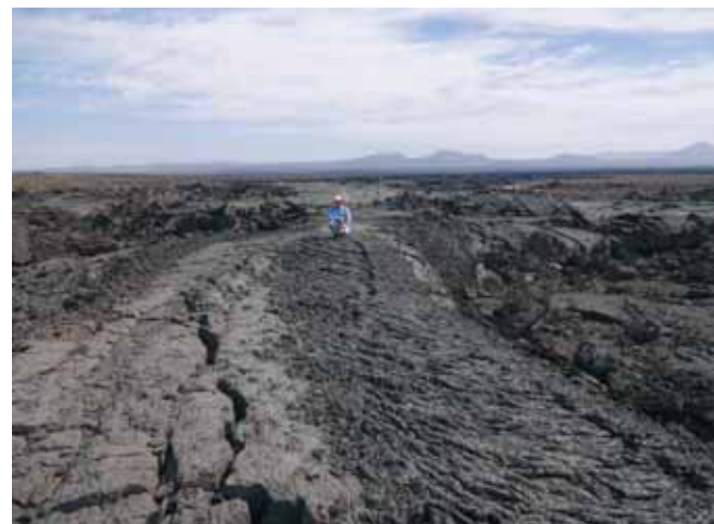
Fig. 5. A frozen "stream" of pahoehoe lava, same locality as Figure 2

The trip to the white volcanoes occupies the better part of a morning, so if the intention is to spend any time exploring the area, the visitor needs to take along a camping tent and sleeping bag, as no facilities of any kind are available on site.