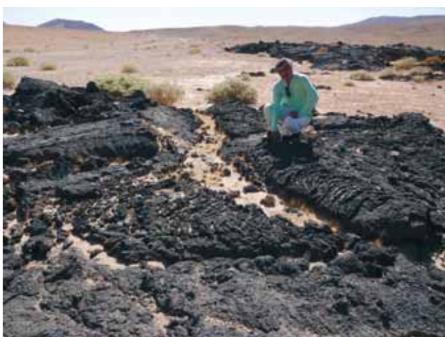
Fig. 18. Pahoehoe lava structures at the edge of the lava flow