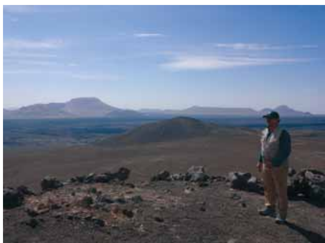
Fig. 8. View toward the white volcanoes from the far side of the cinder cone. Jellyfish-shaped Jabal al Abayda is on the left, the lower broader cone of Jabal al Bayda is in the far distance. A sea of more recent black lava is seen in the middle foreground